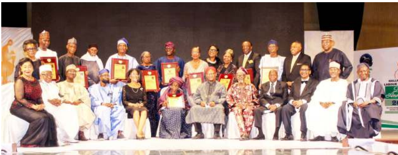
Group Picture of Awardees