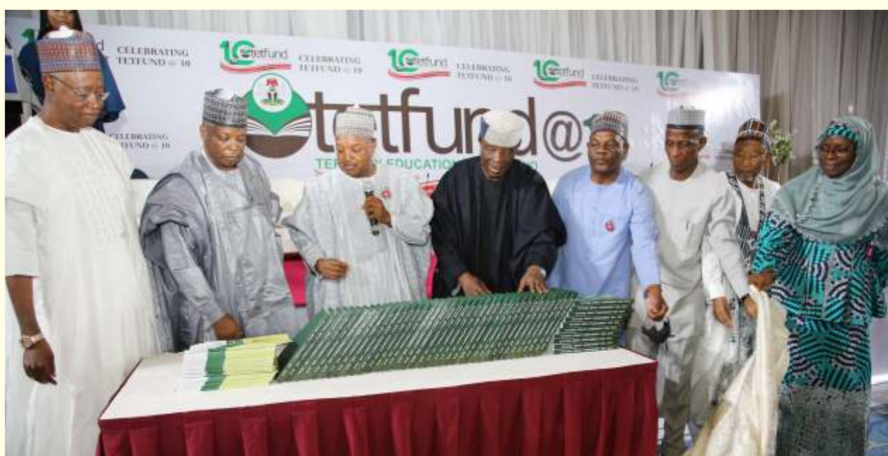
The representative of the Minister of Education, His Excellency, the Governor of Kebbi State, Sen. Abubakar Atiku Bagudu (3rd from left) leading dignitaries to unveil the TACIA report during the 10TH Anniversary Celebration of the Fund held at the Transcorp Hotel Abuja.