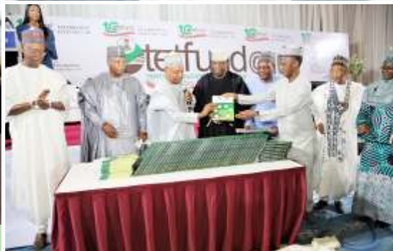
The representative of the Minister of Education, His Excellency, the Governor of Kebbi State, Sen. Abubakar Atiku Bagudu (3rd from left) leading dignitaries to unveil the TACIA report during the 10TH Anniversary Celebration of the Fund held at the Transcorp Hotel Abuja.