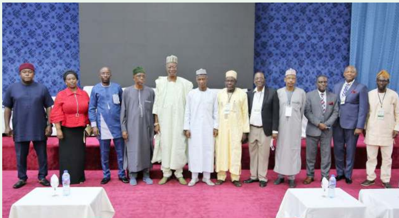
Group Photography of dignitaries and facilitators at the event.

The Tertiary Education Trust Fund (TETFund) recently in Lagos held a two-day capacity building workshop for its beneficiary universities aimed at strengthening them for higher global ranking and competitiveness.