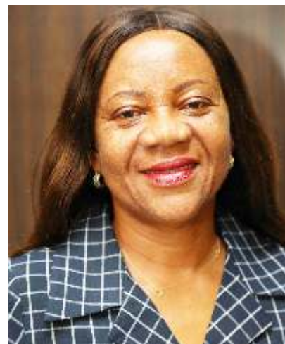
UKIM Comfort Ini 19th October