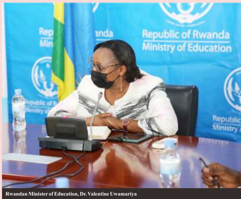
Rwandan Minister of Education, Dr. Valentine Uwamariya

The Minister who expressed appreciation to the Executive Secretary for the visit stated that Nigeria and Rwanda had