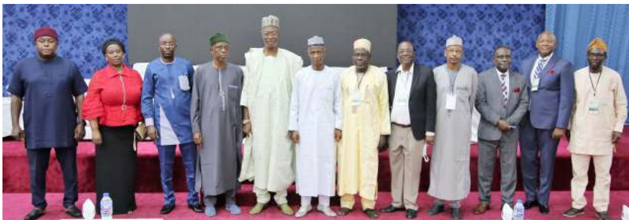
Group Photography of dignitaries and facilitators the TETFund Capacity Building Workshop for Public Universities; Theme: Requirements for strengthening Nigerian Universities for Higher Global Ranking and Knowledge Economy. Held at NAF Conference Centre in Abuja