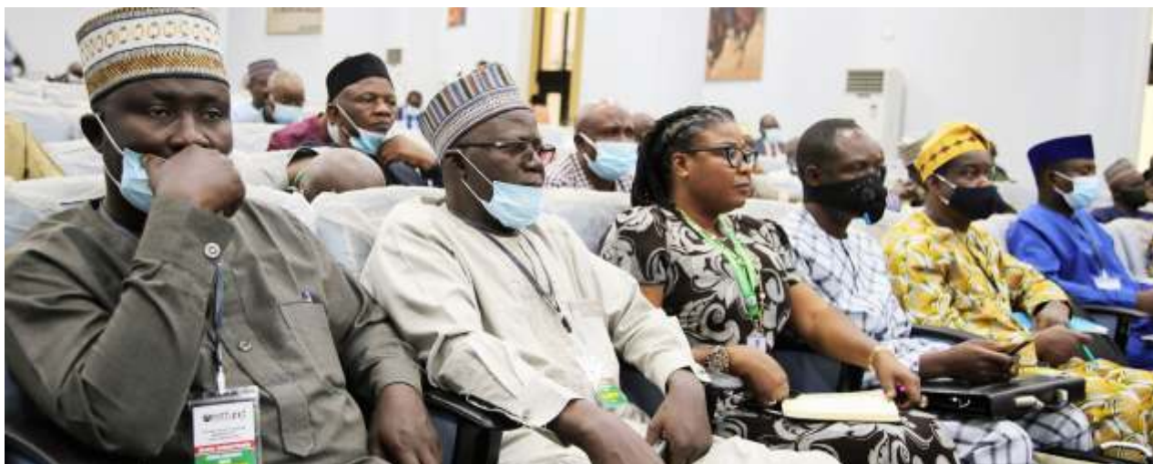
Cross section of participants at the TETFund Capacity Building Workshop for Public Universities; Theme: Requirements for strengthening Nigerian Universities for Higher Global Ranking and Knowledge Economy. Held at NAF Conference Centre in Abuja.