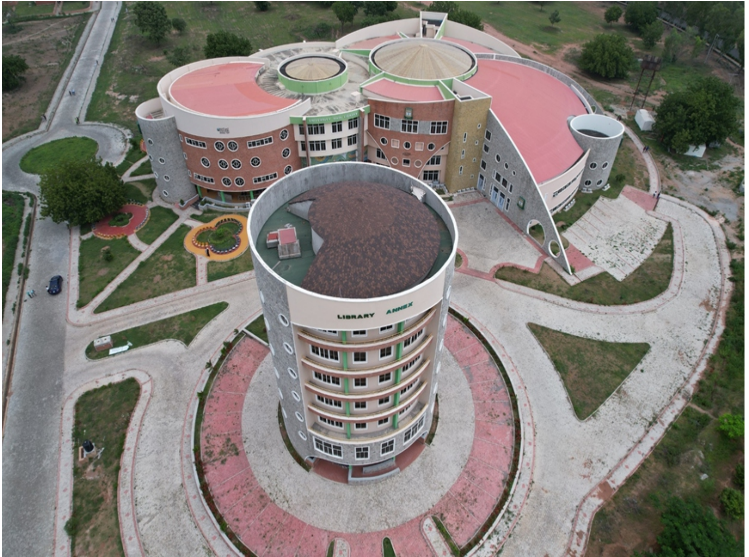
An aerial view of the President Muhammadu Bahari main Library Complex, Kwara State University, Maletе