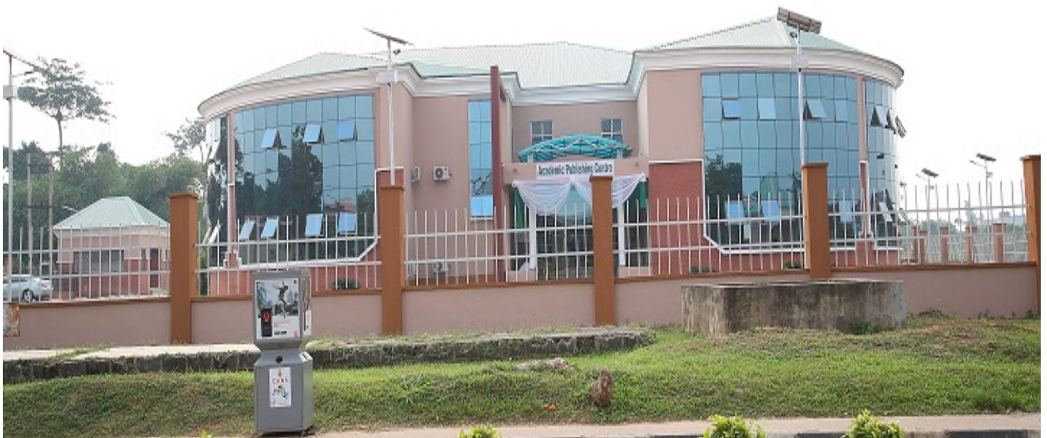
The Academic Publishing Centre, University of Lagos, Lagos