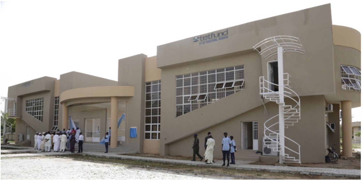
Twin Theatre, Department of Microbiology, Bayero University, Kano