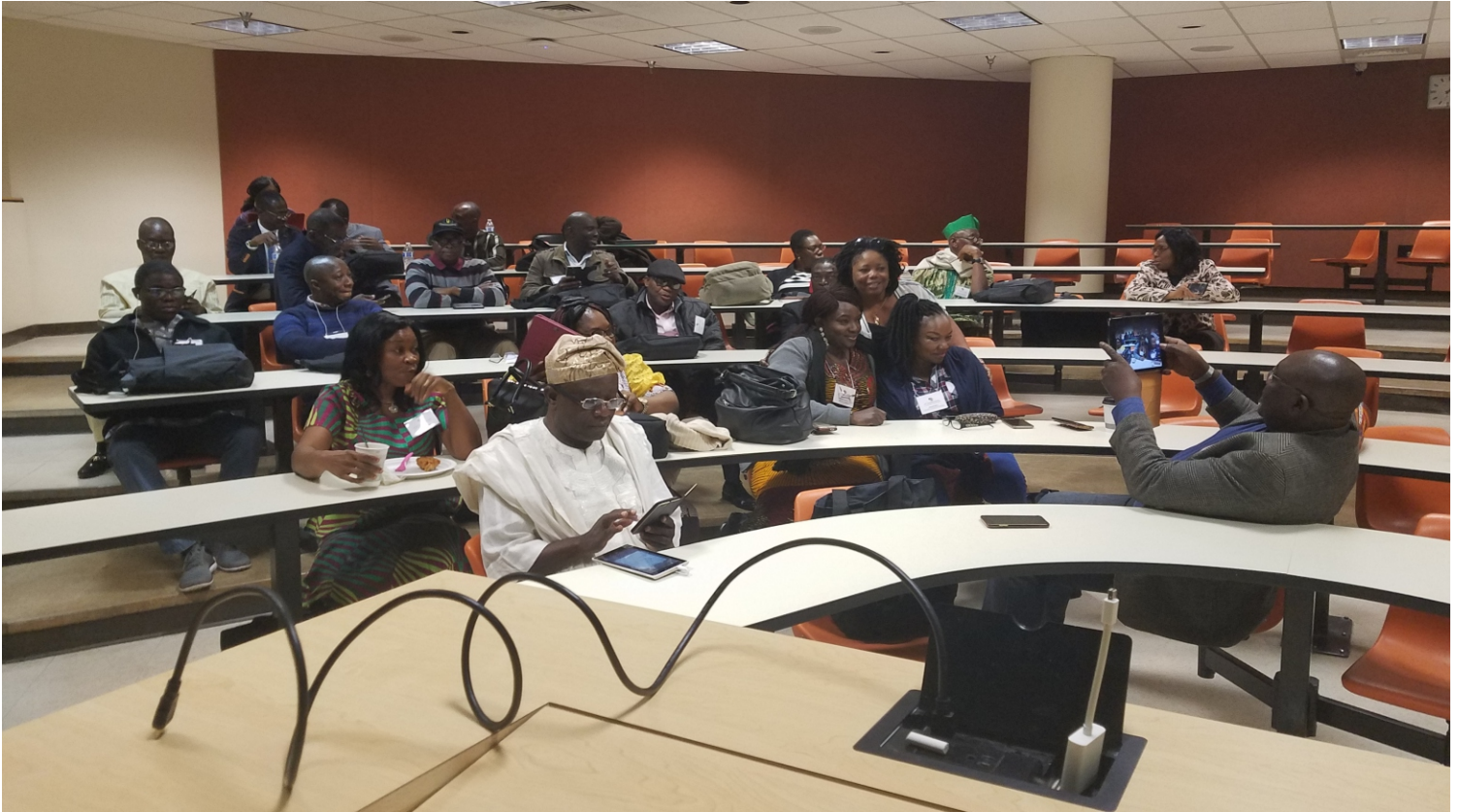
TETFund Conferees attending a conference in the United States of America