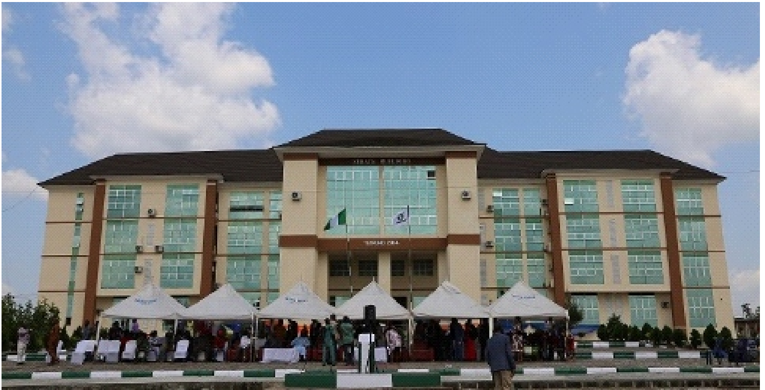
The Senate Building, Imo State University, Owerri