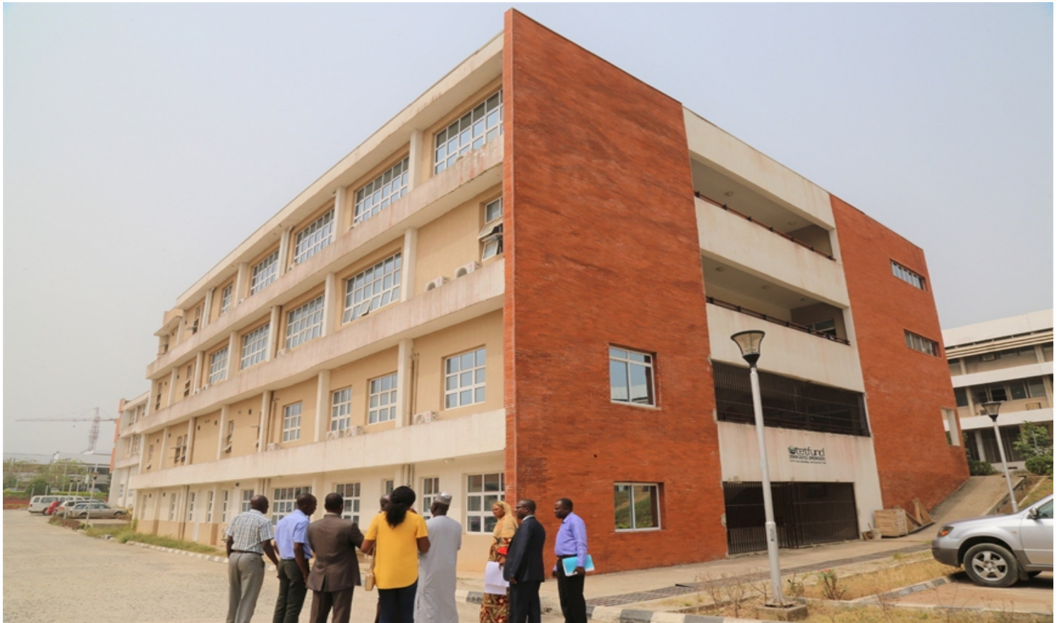
Pharmacy Phase II Building, Obafemi Awolowo University, Ile-Ife