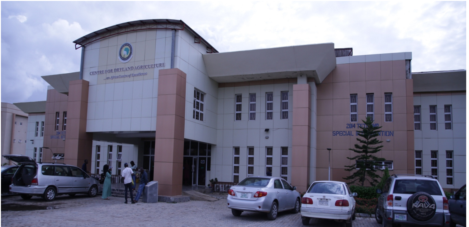
Centre 4 Dryland Agriculture, Bayero University, Kano