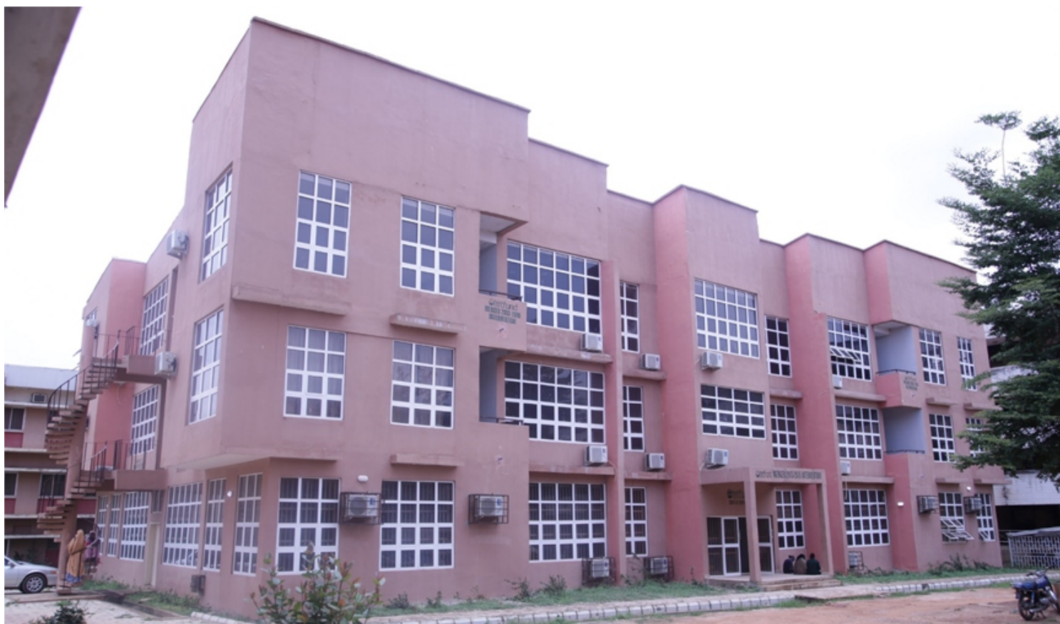
Staff Offices and Complex for College of Science and Technology, Kaduna State University