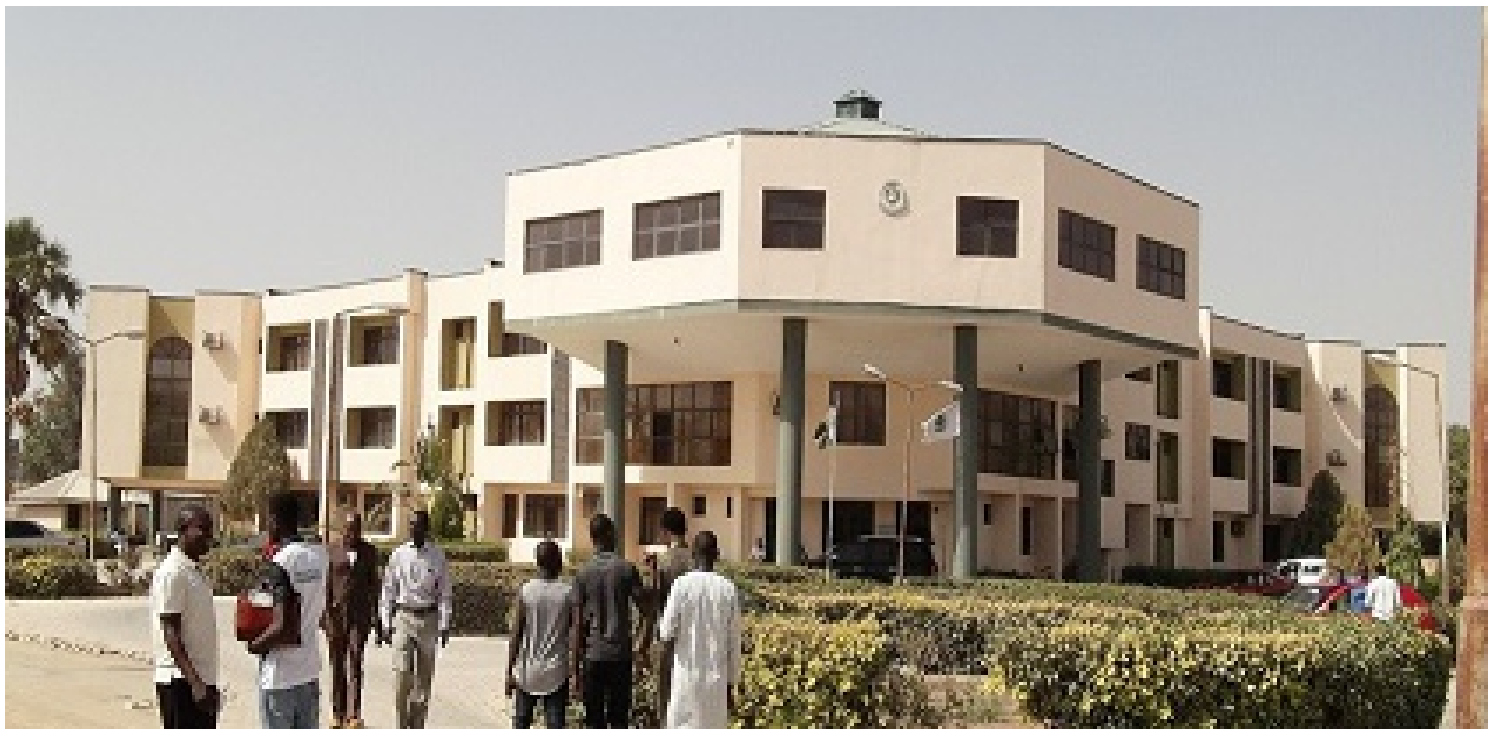
Senate Building, Adamawa State University, Mubi