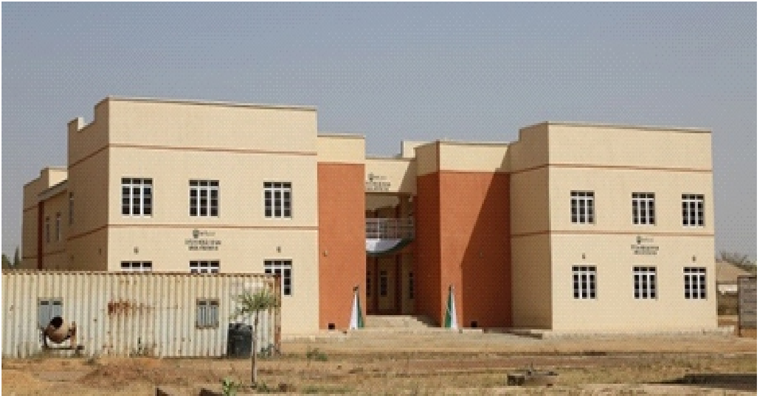
18 Classroom Block Lecture Hall, Abubakar Tatari Ali Polytechnic, Bauchi