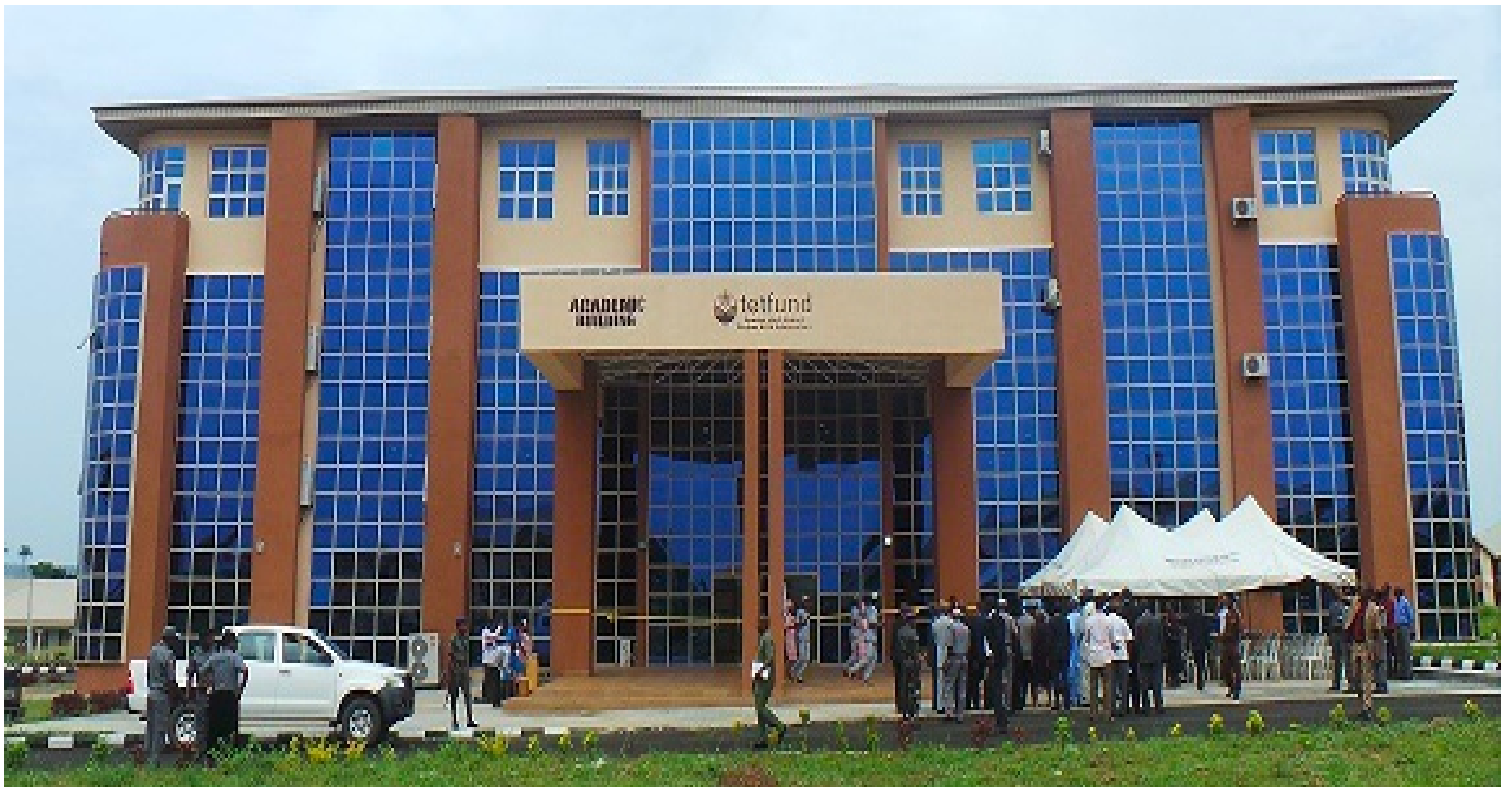
The Academic Building, Ekiti State University, Ado-Ekiti