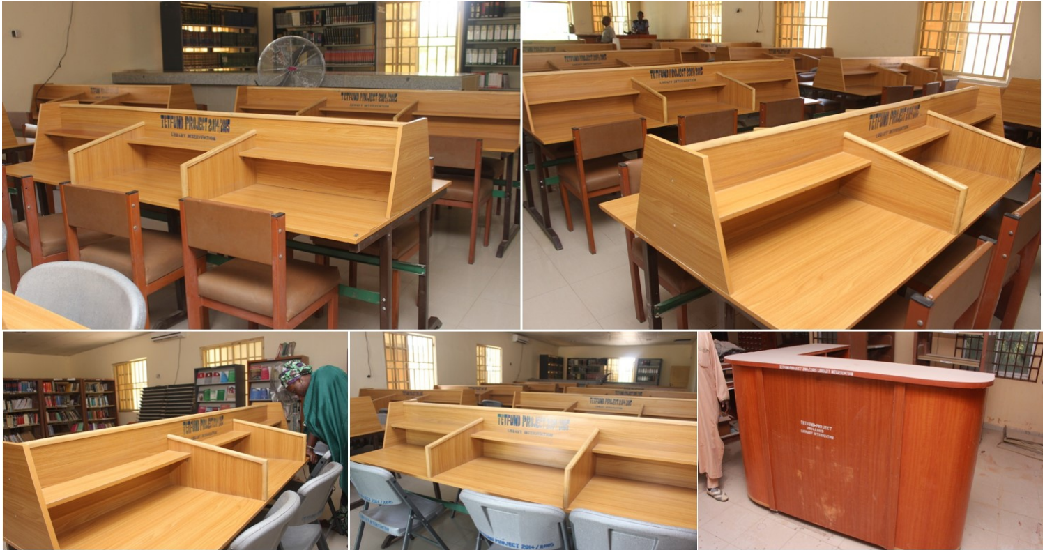
Library, Nigeria Police Academy, Wudil, Kano