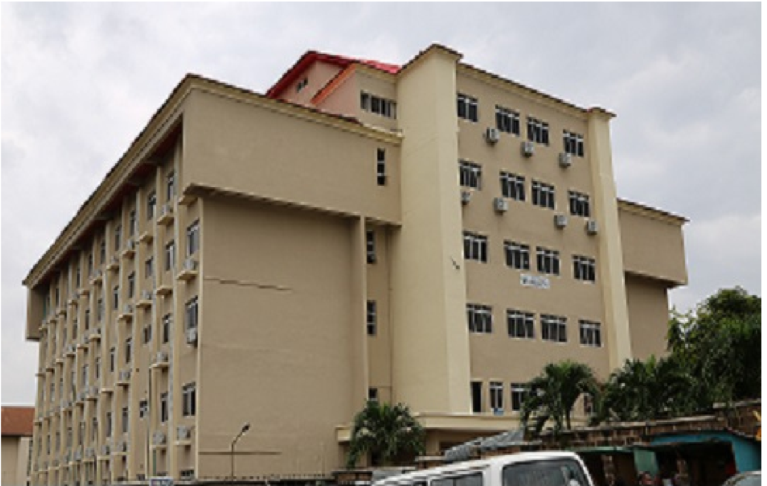
National Institute of Maternal and Child Health Building, University of Ibadan