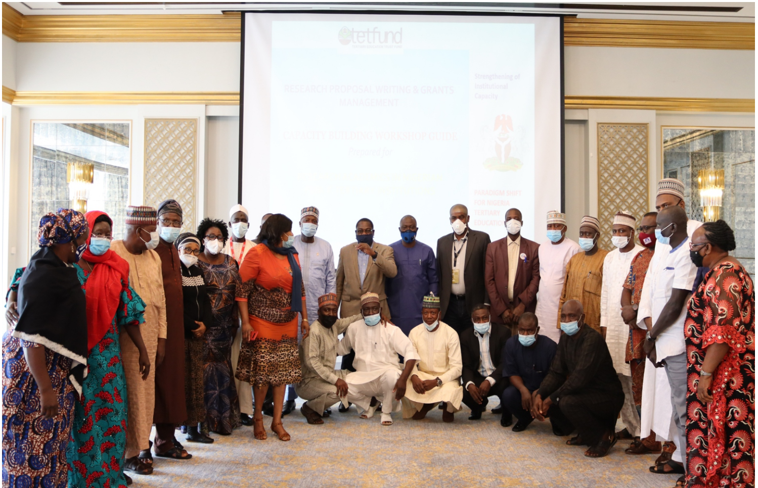
Participants at the Research Administration Capacity Building Workshop for Universities, Dubai