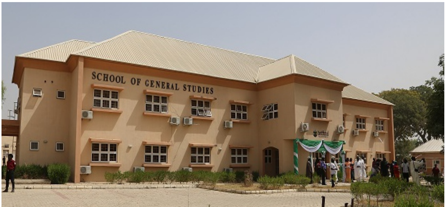
School of General Studies Building, Federal Polytechnic, Bauchi