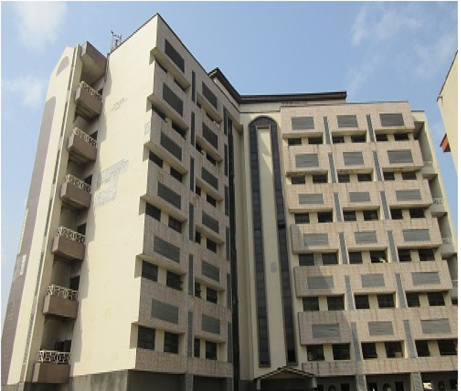
Seven Storey Building, Yaba College of Technology, Yaba, Lagos