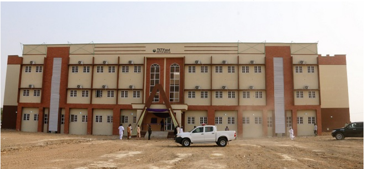
Academic Building, Federal University of Technology, Minna