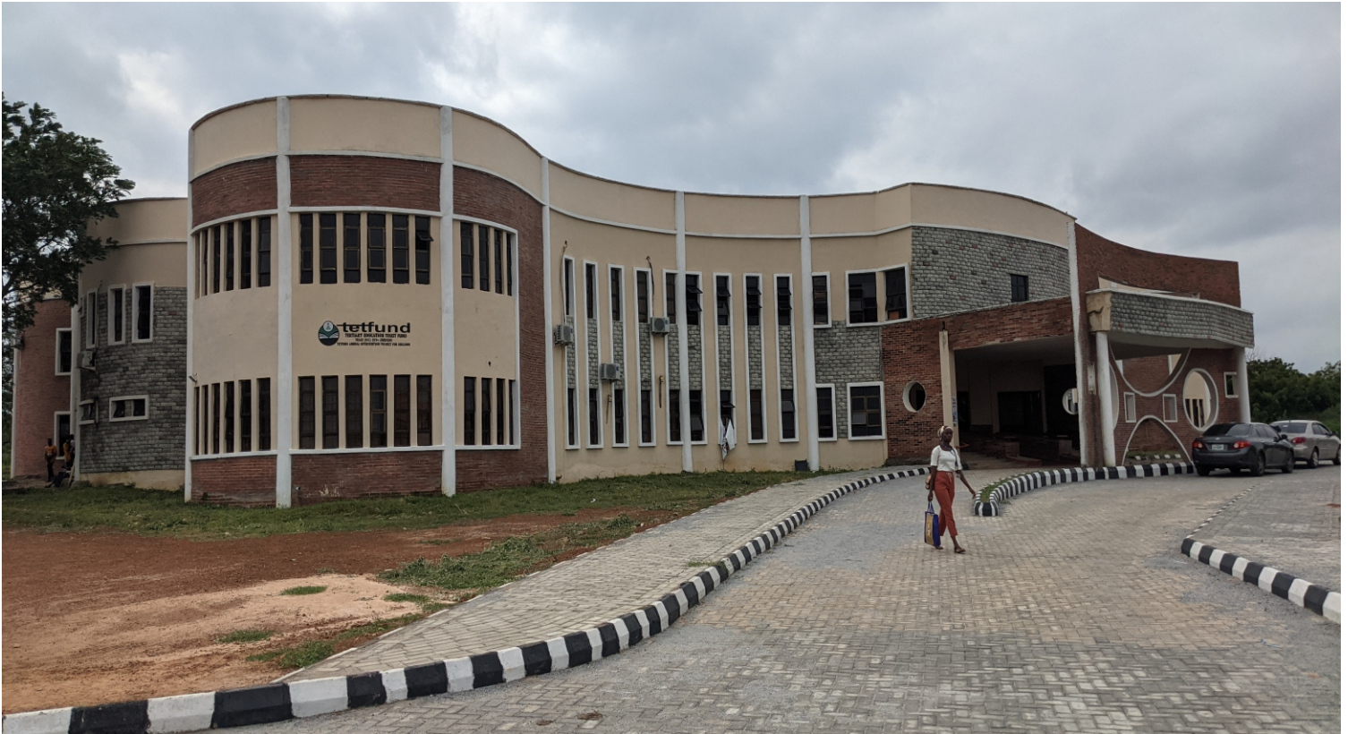
Social Science Building, Kwara State University