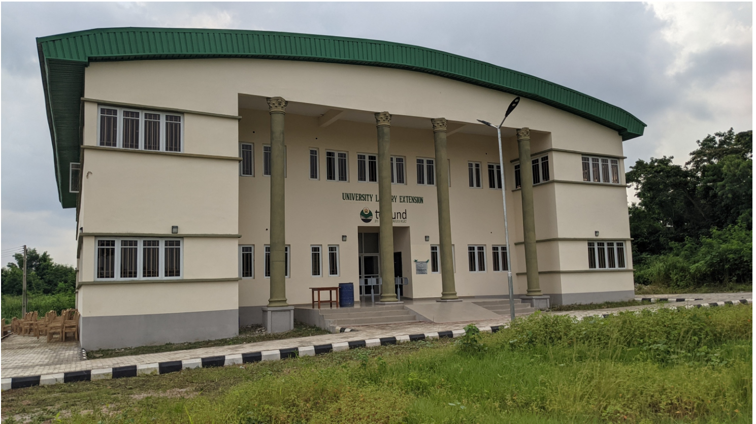
Library Extension, Federal University of Agriculture, Abeokutai