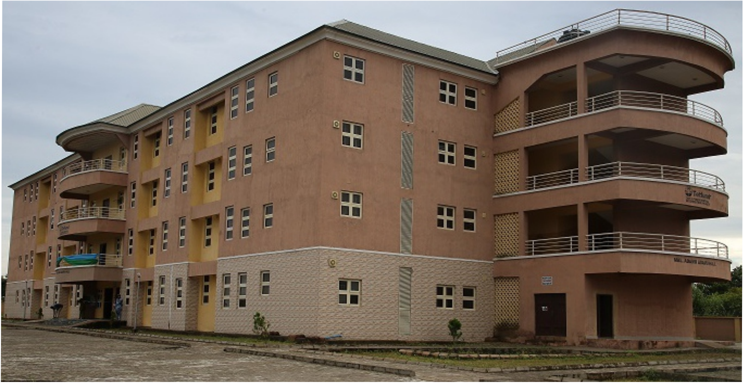
Male Hostel (Adamu Adamu Hall), Federal University, Wukari