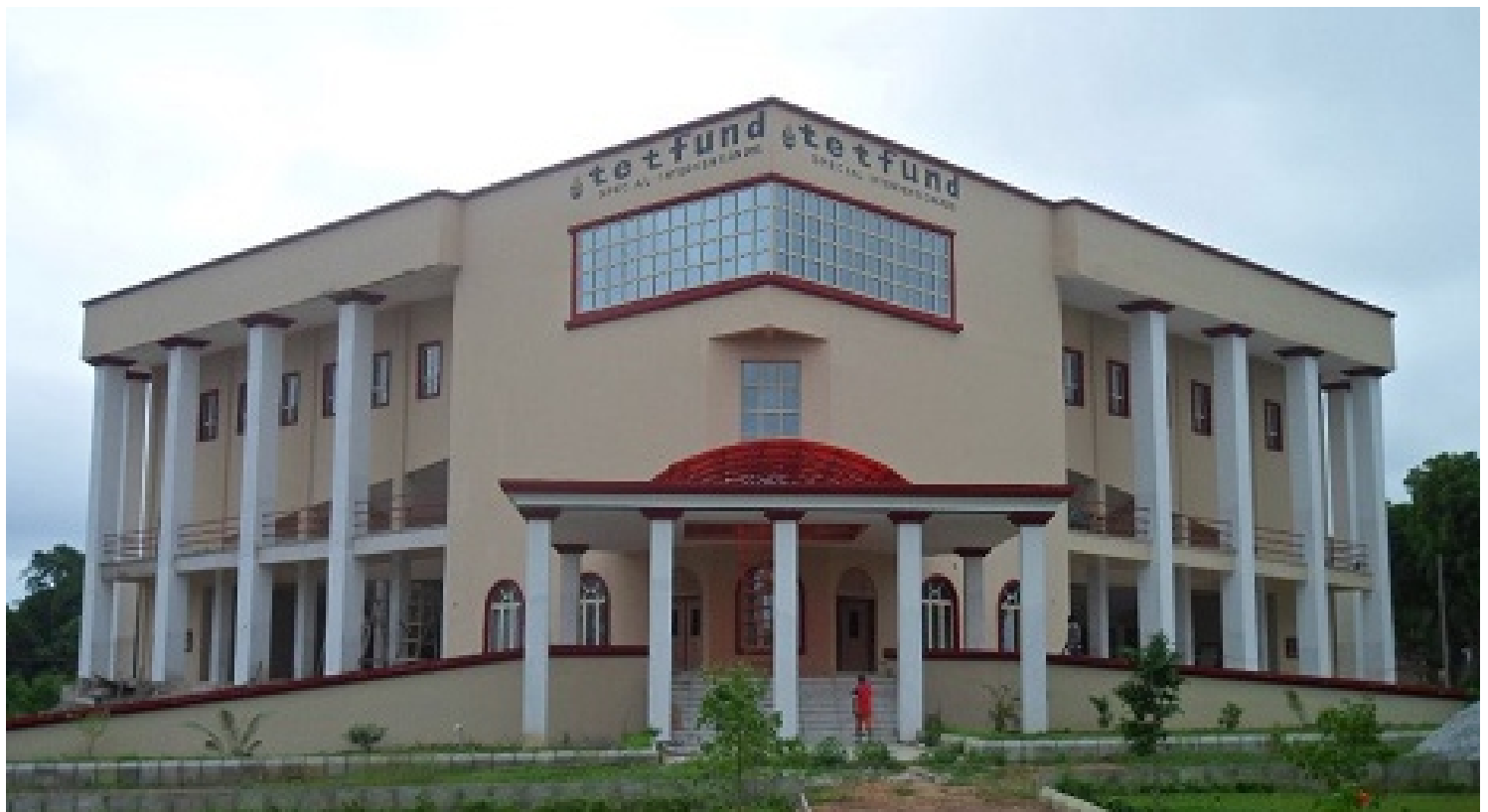
Great Hall, Ladake Akintola University of Technology, Ogbomosho