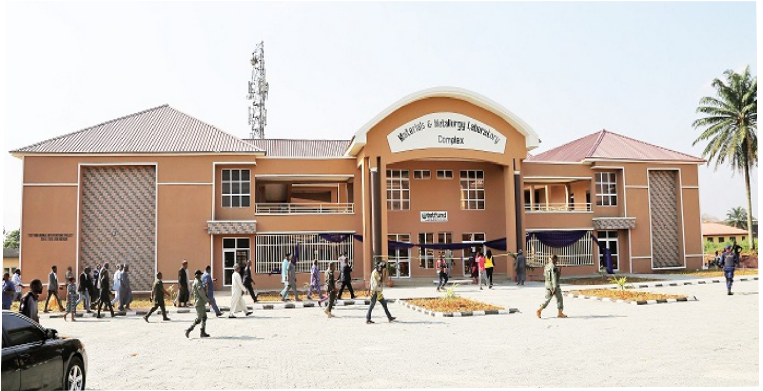
Materials and Metallurgy Laboratory Complex, University of Benin