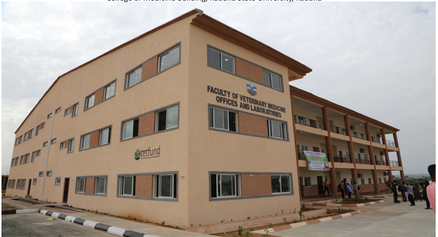
Faculty of Veterinary Medicine Building, University of Jos