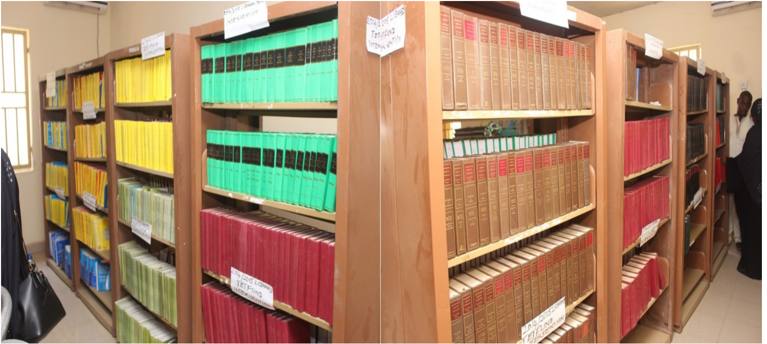
Library, Nigeria Police Academy, Wudil, Kano