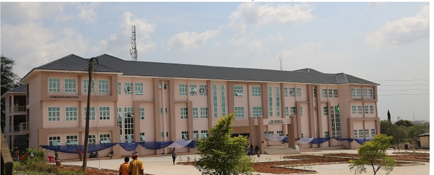
Information and Communication Centre, Imo State Polytechnic, Umagwo