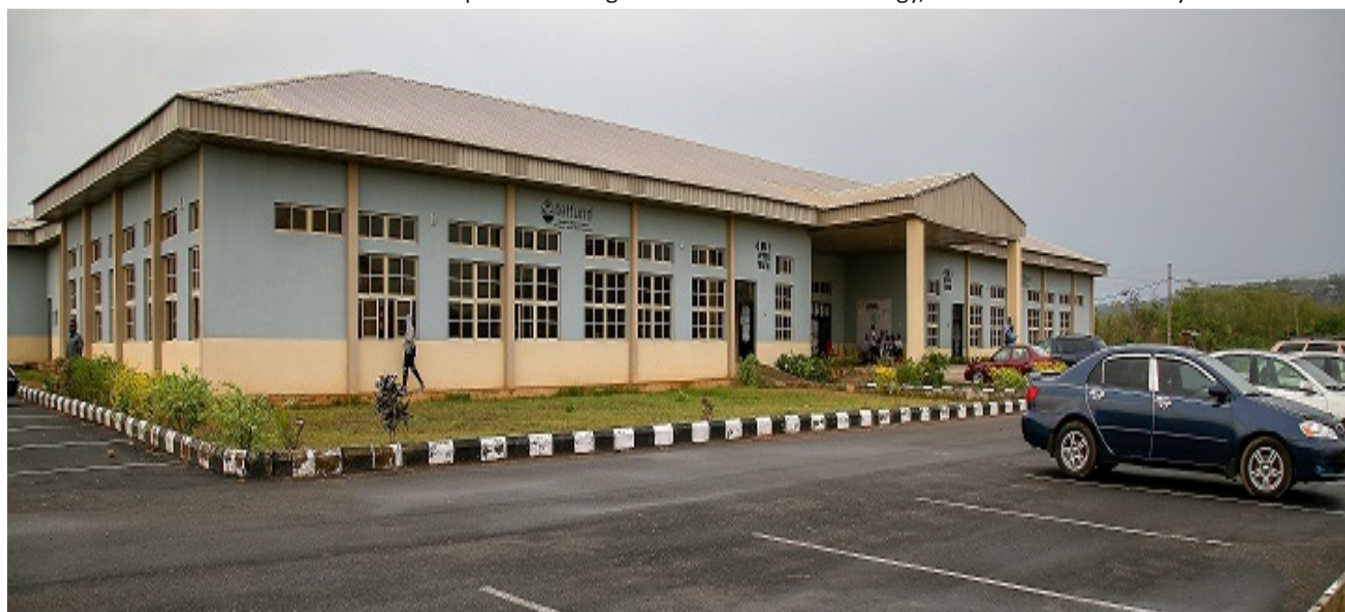
4 in 1 Lecture Theatre, Ekiti State University