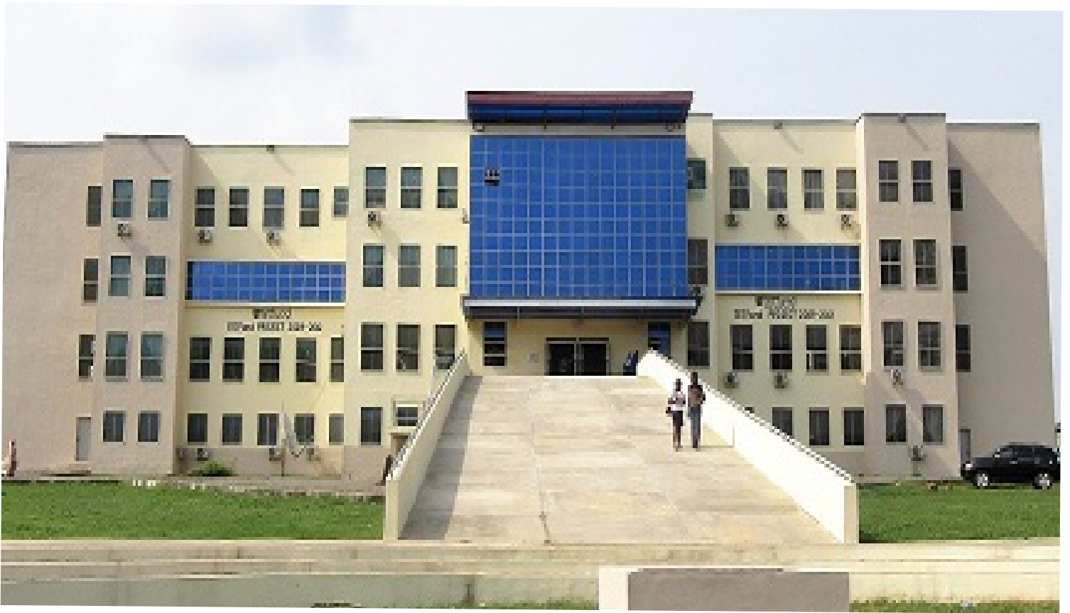
University Library, Olabisi Onabanjo University, Ago-Iwoye