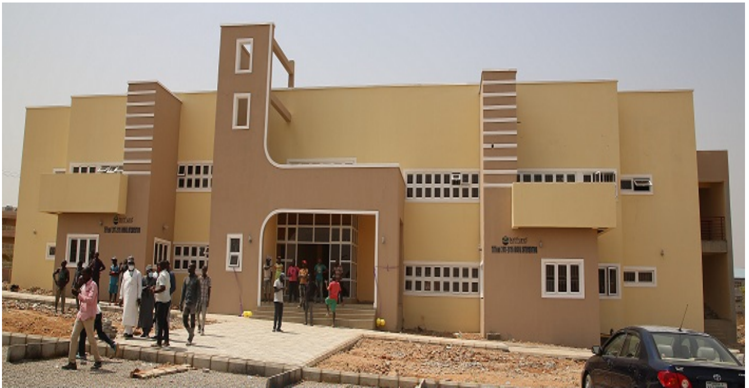
The Faculty of Science (Annex Building), Federal University, Lafia