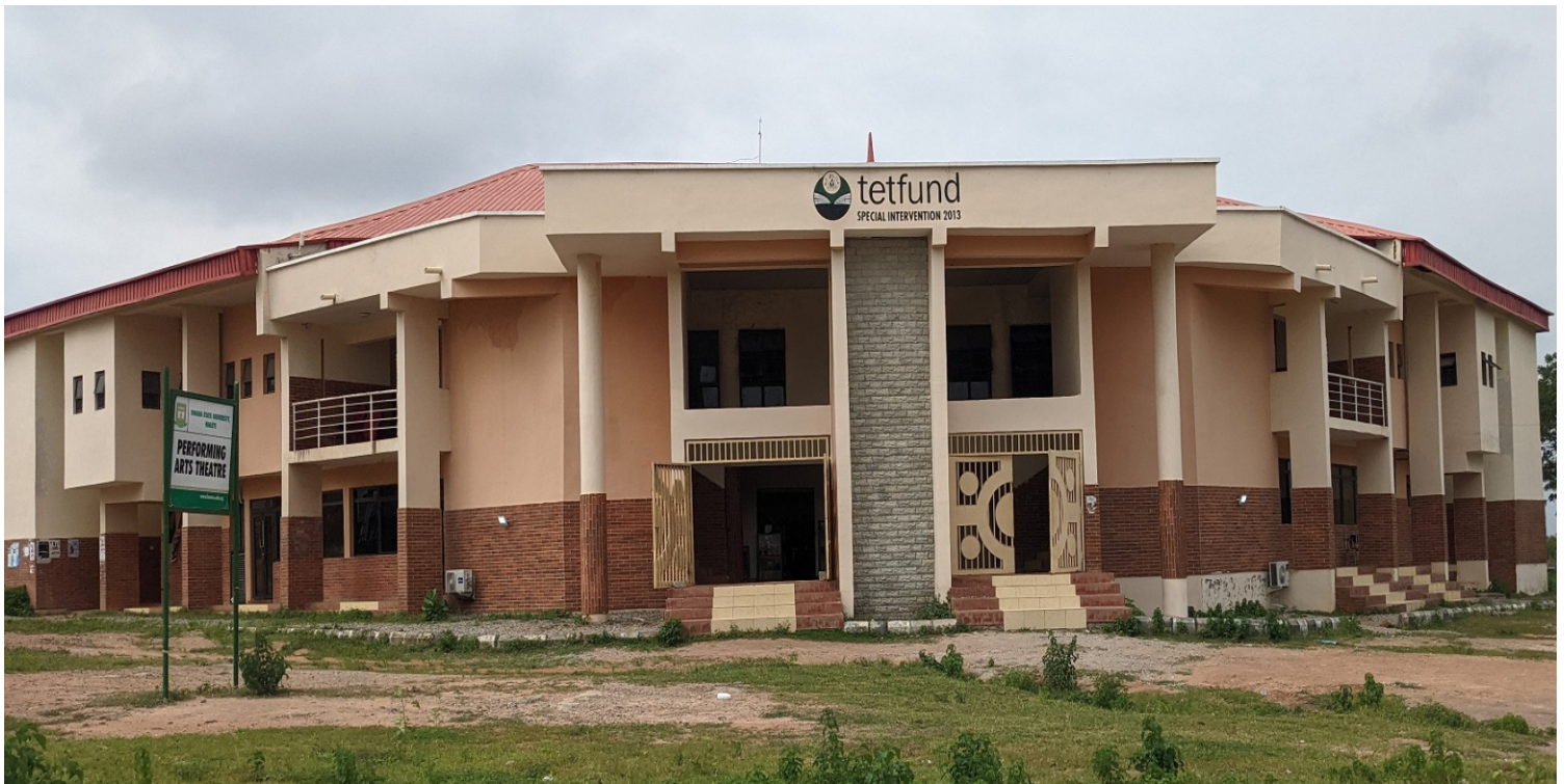
Performing Arts Theatre, Kwara State University, Malet