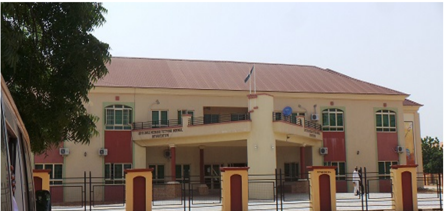
Senate Building, Hussaini Adamu Polytechnic, Kazaure