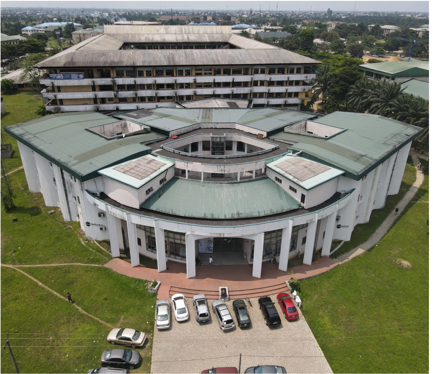
An aerial view of the Animal and Environmental Biology Building, University of Port Harcourt