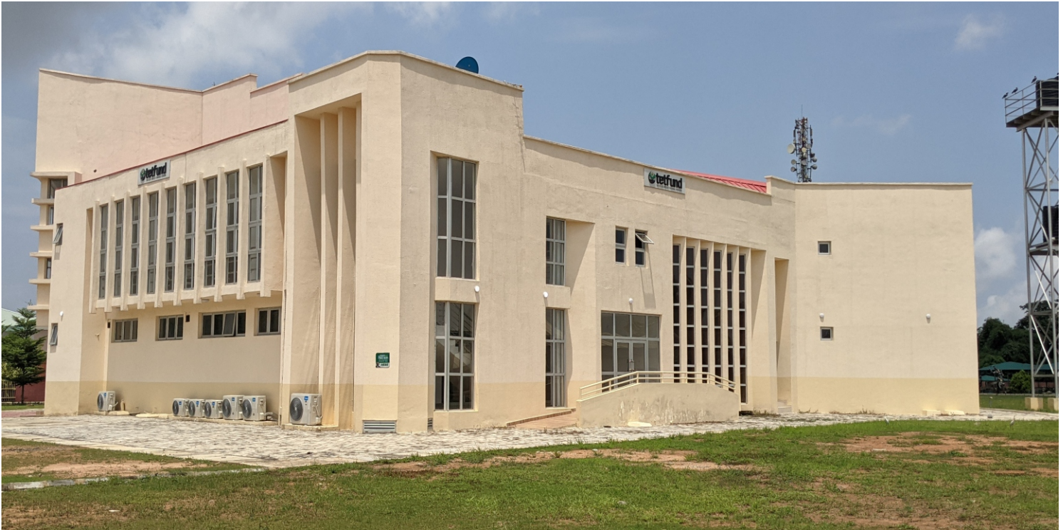
Lecture Theatre, Faculty of Social Science, University of Lagos