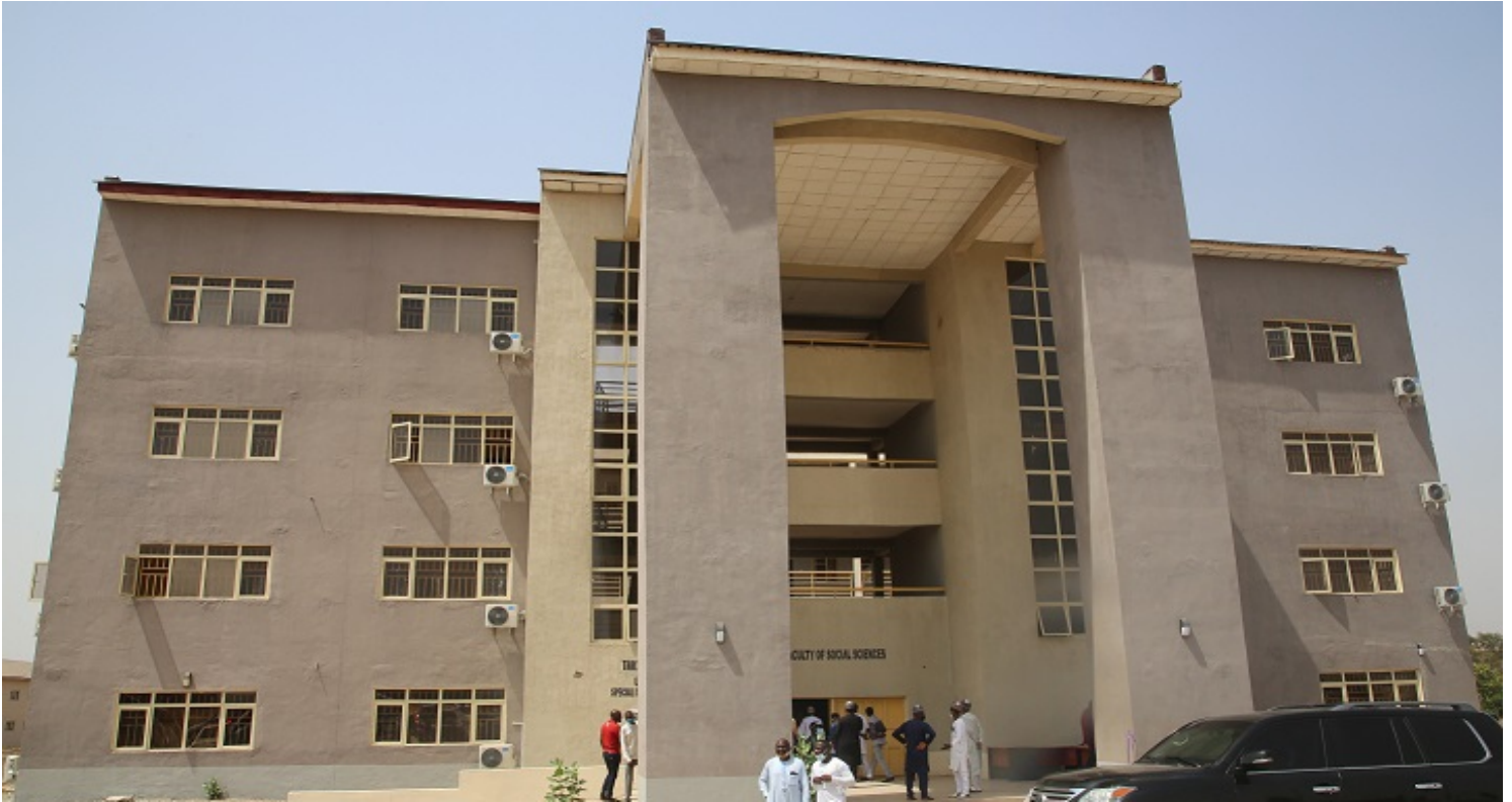
Faculty of Social Science, Federal University, Lafia