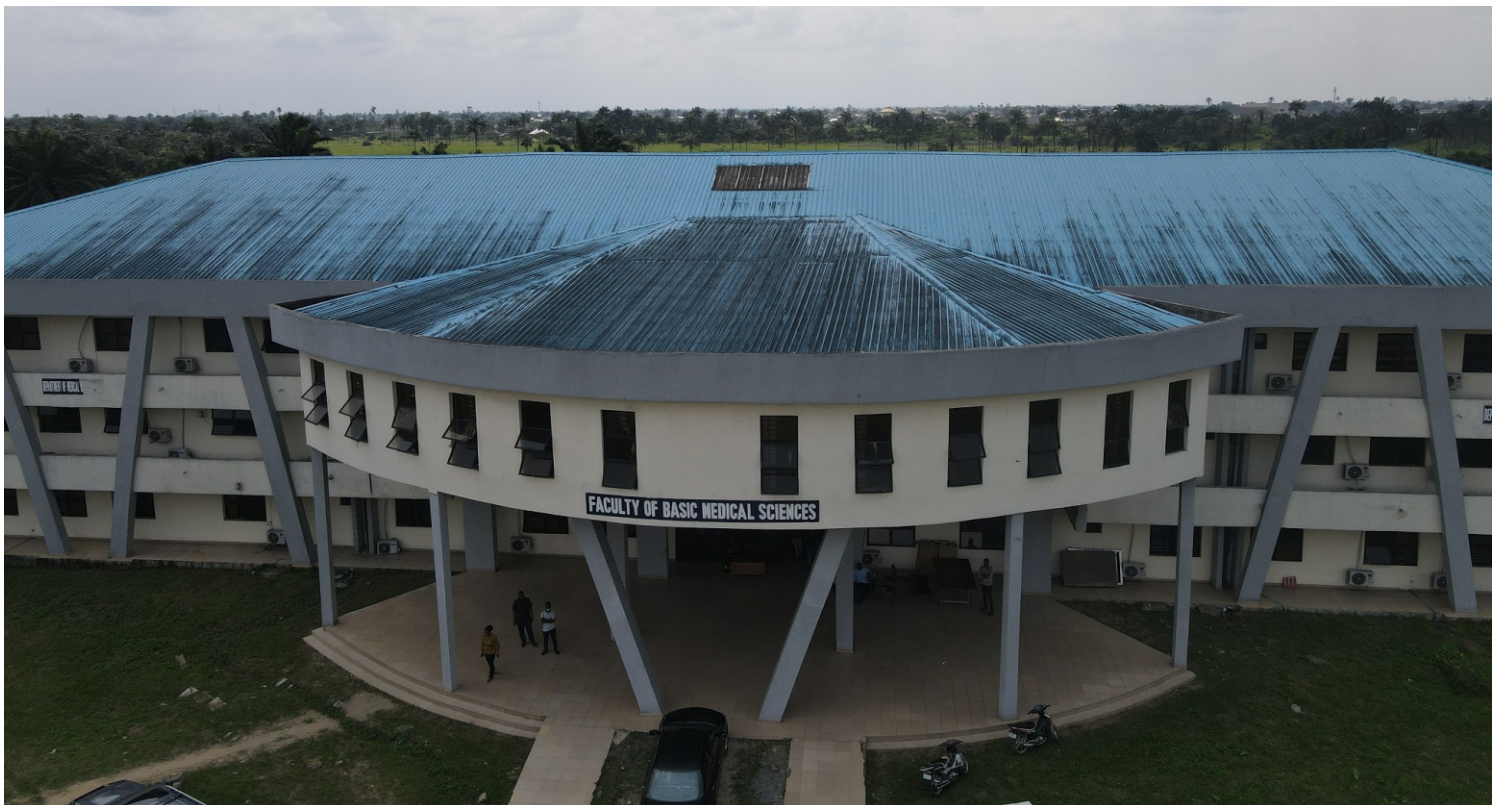
Faculty of Basic Medial Sciences, University of Port Harcourt