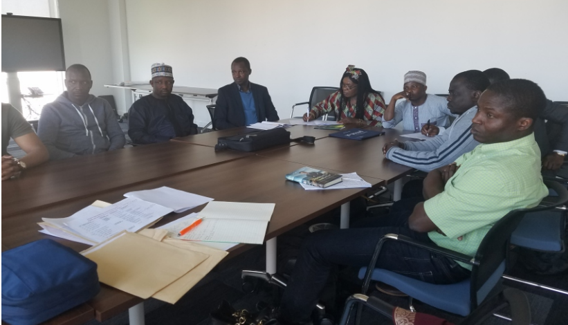
TETFund Scholars in the United Kingdom