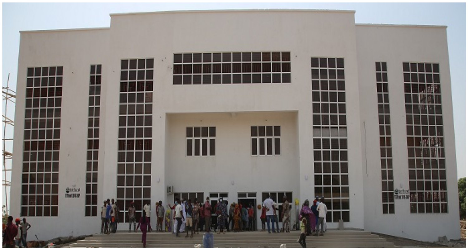
The Senate Building, Federal University of Lafia, Nassarawa State