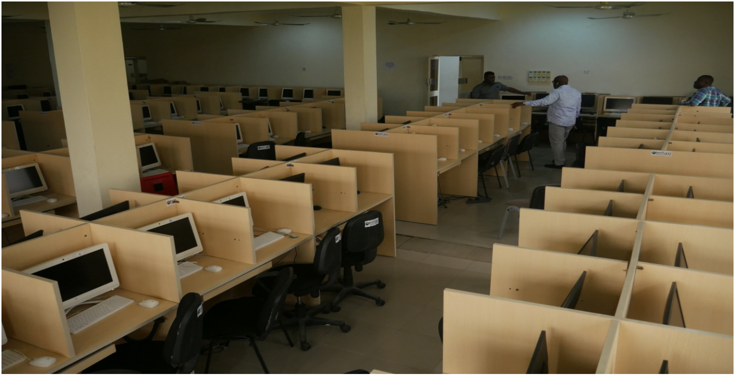
Akwa Ibom State University ICT Centre