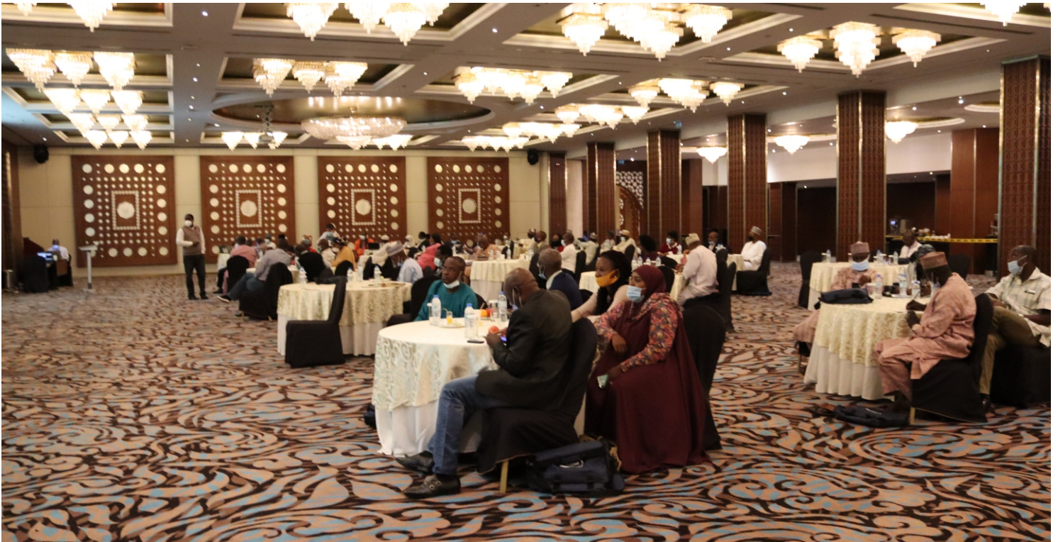
Participants at the Research Administration Capacity Building Workshop for Universities, Dubai