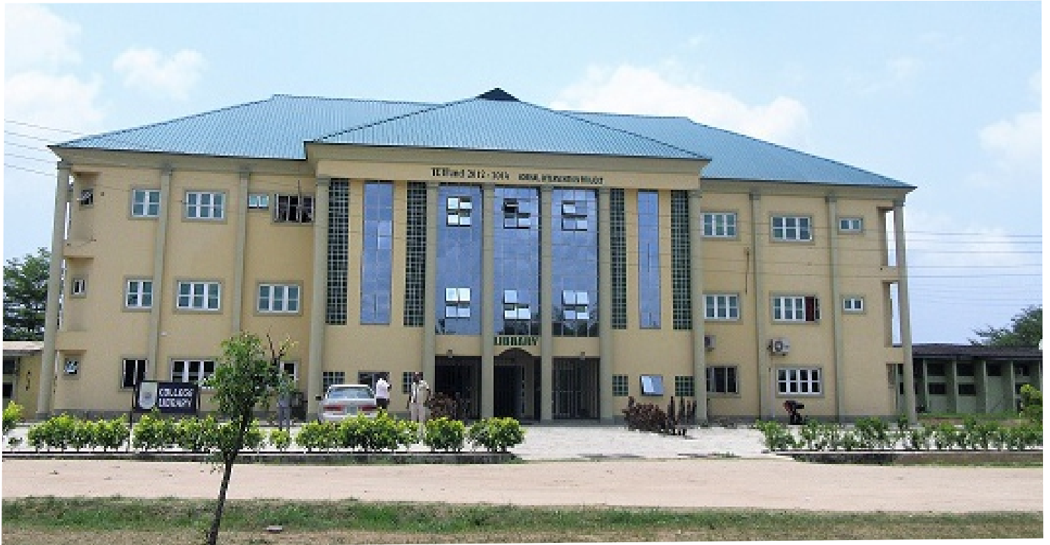
Library Building, Federal College of Education, Ijaniki, Lagos