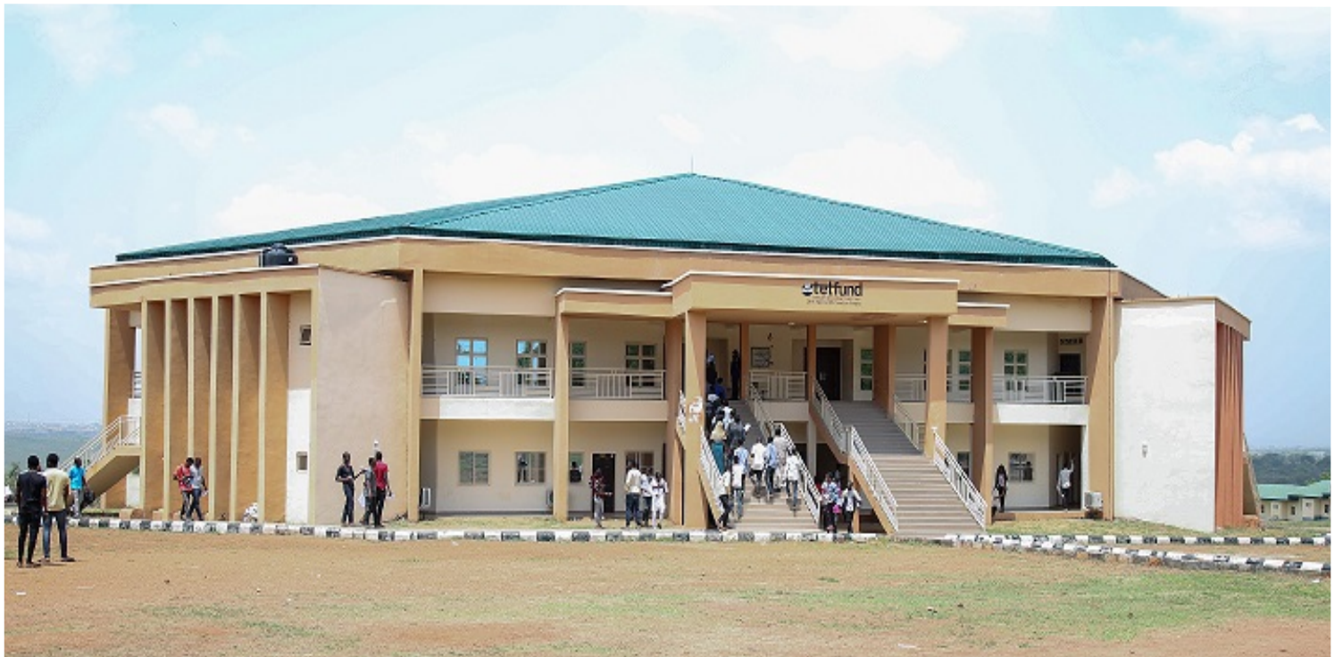
500 Capacity Lecture Theatre, University of Ilorin