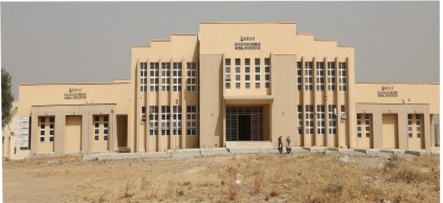
School of Social and Management Science, Bauchi State University, Bauchi