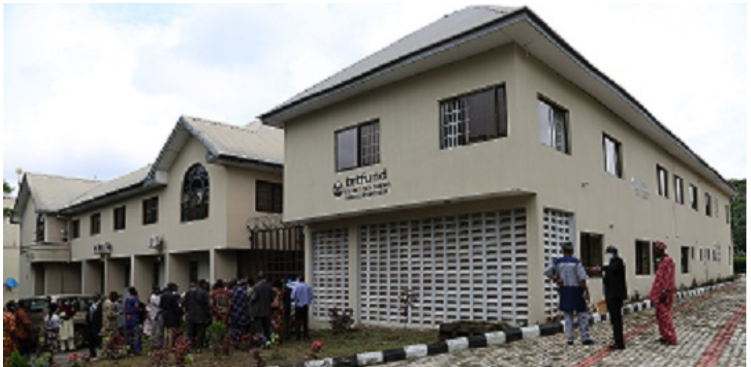
Agricultural Extension Department Building, University of Ibadan