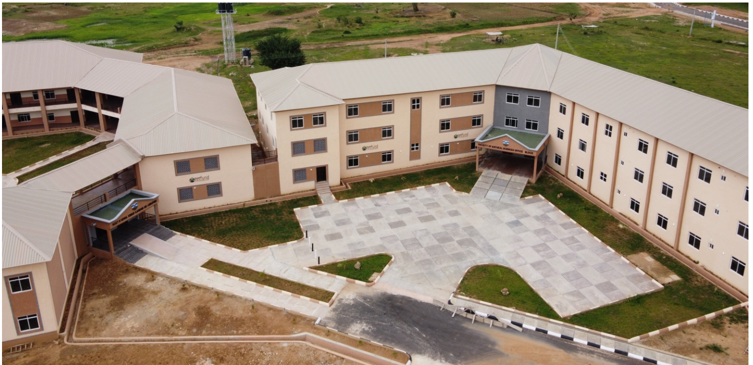
An aerial view of the Faculty of Natural Sciences Classrooms and Laboratory, University of Jos