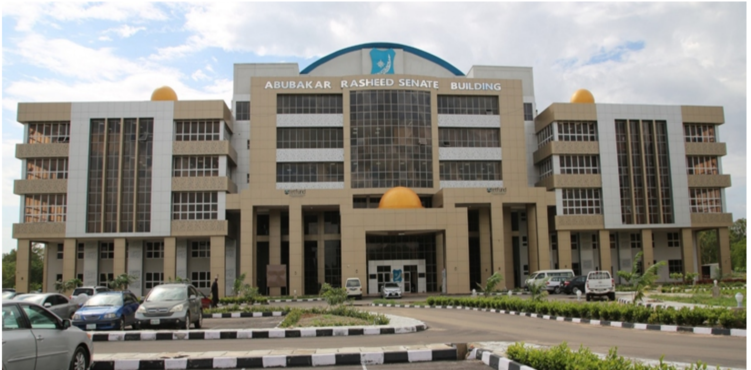
Abubakar Rasheed Senate Building, Bayero University, Kano