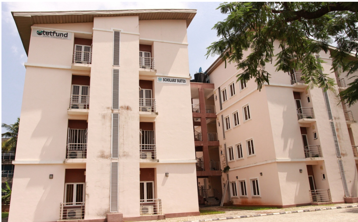
Scholars Suites, University of Lagos