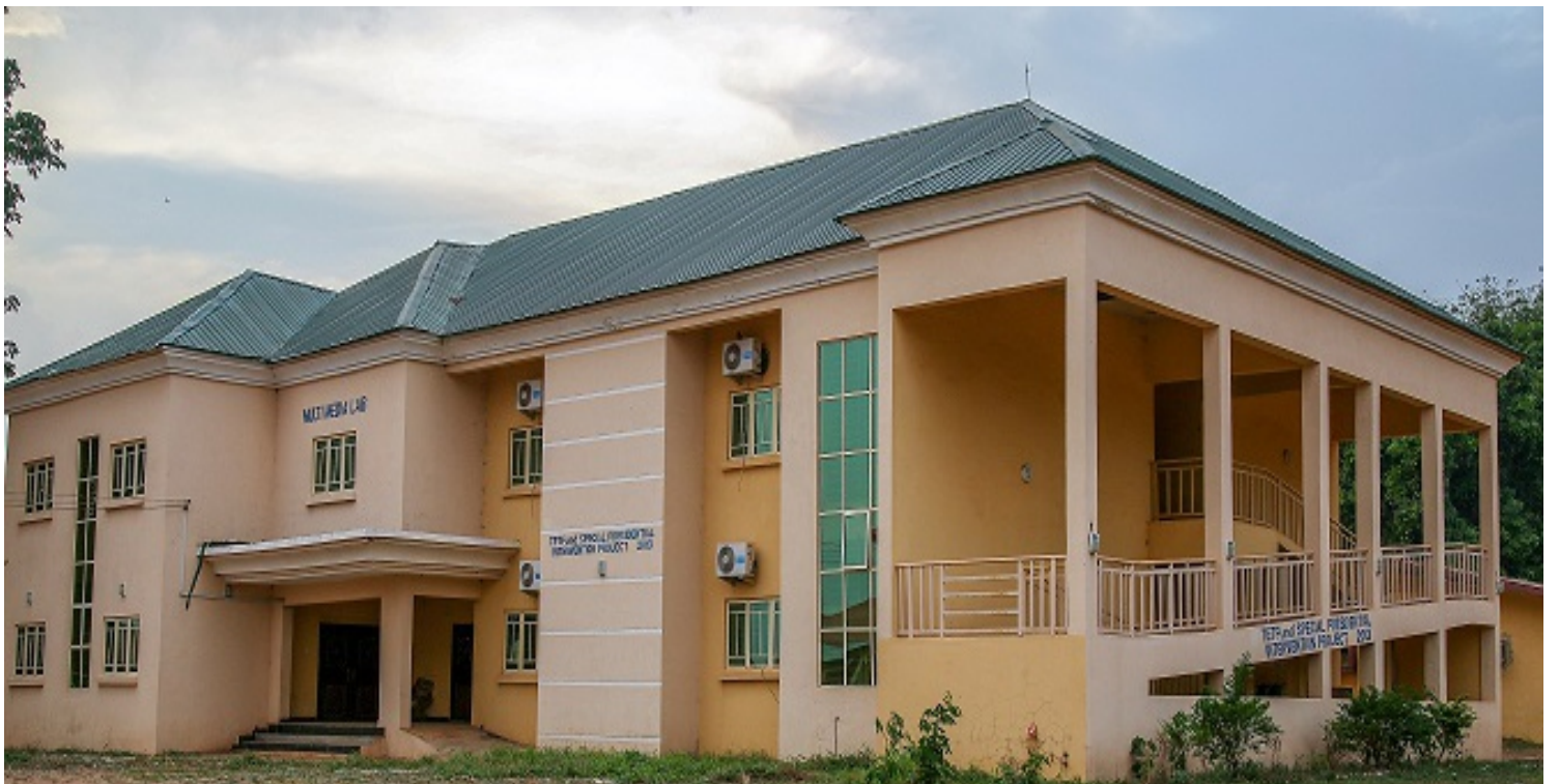
Multi-Media Laboratory, University of Ilorin