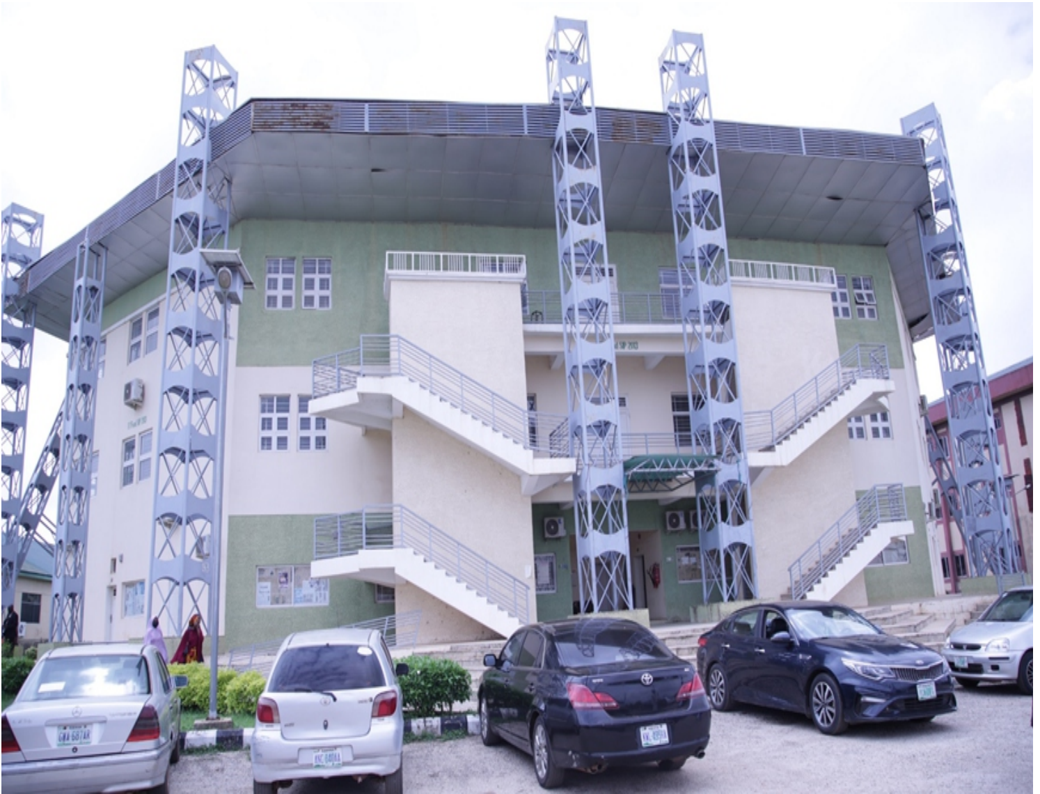
1000 Seater Auditorium, Kaduna State University, Kaduna