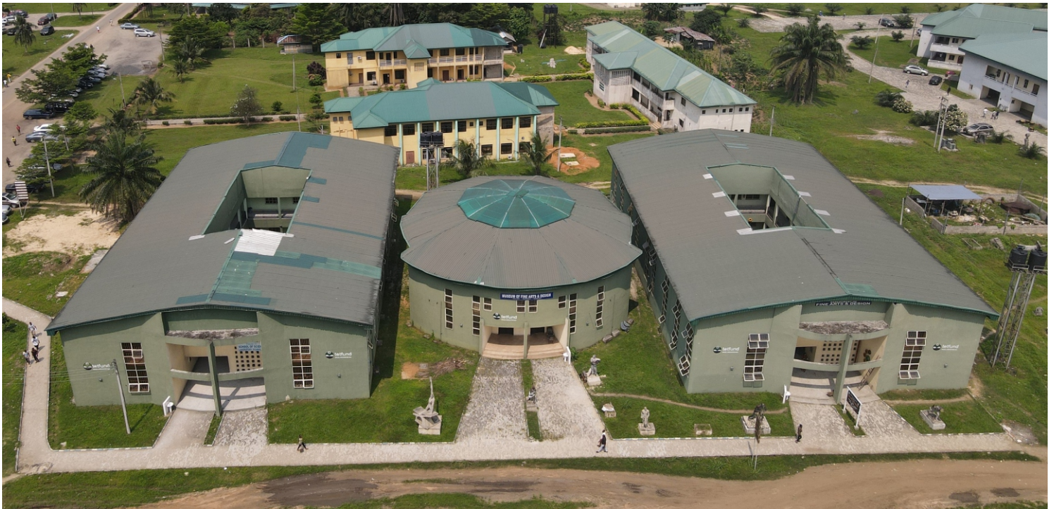
An aerial view of the Fine Arts and Designs Block, University of Port Harcourt