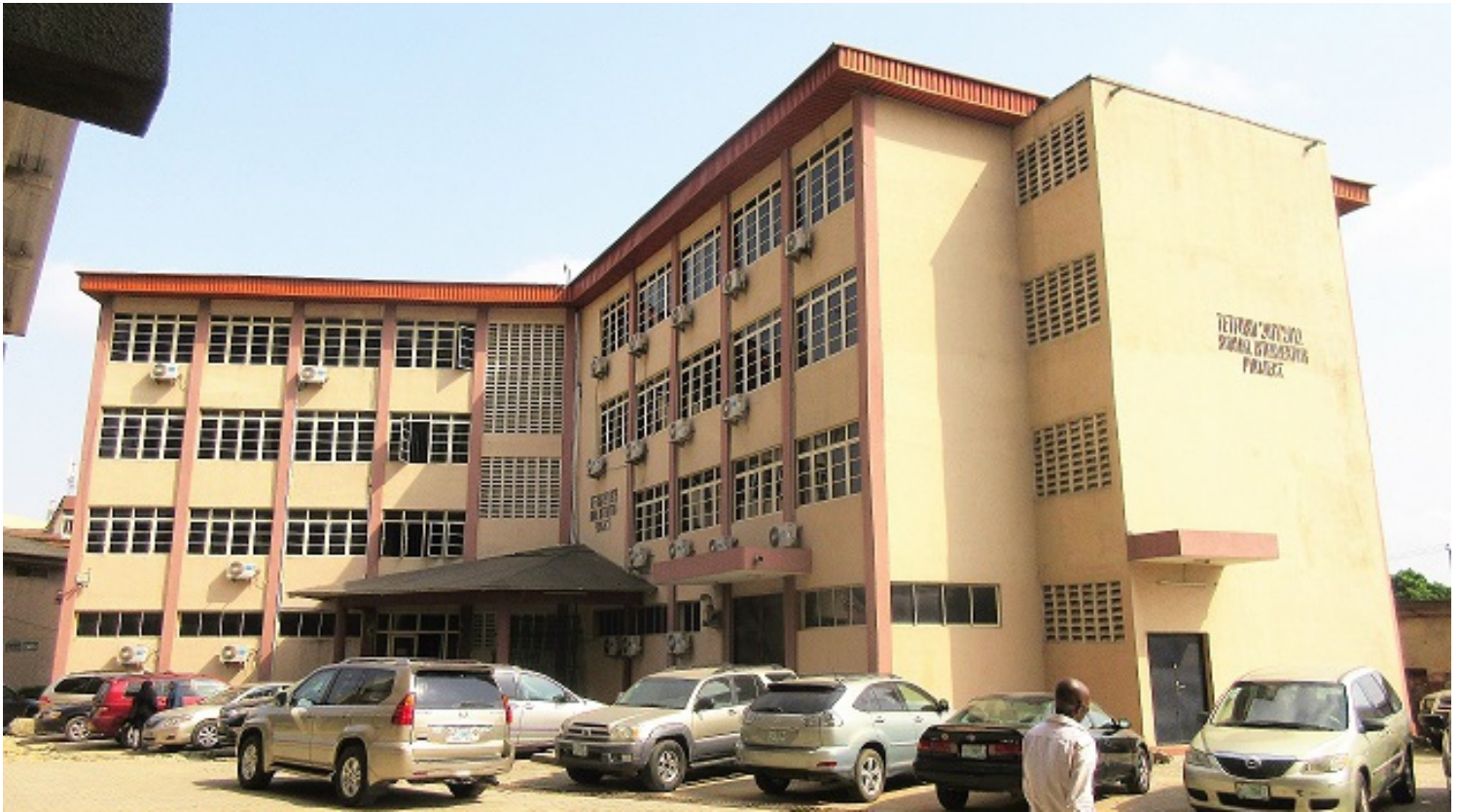
Academic Building, Yaba College of Technology, Yaba, Lagos