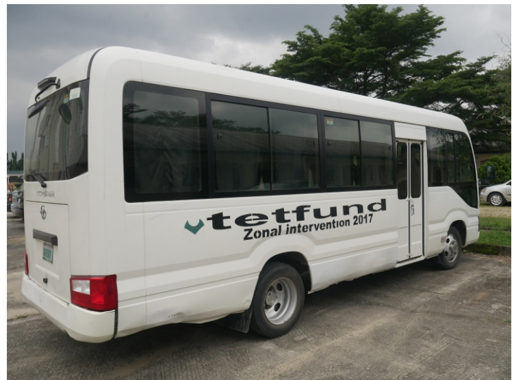
Provision of vehicles to Federal Polytechnic, Ukana, Akwa Ibom and Akwa Ibom State University