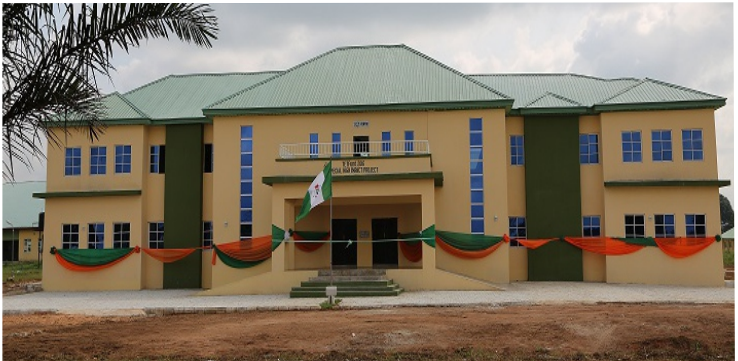
Faculty of Humanities, Imo State University