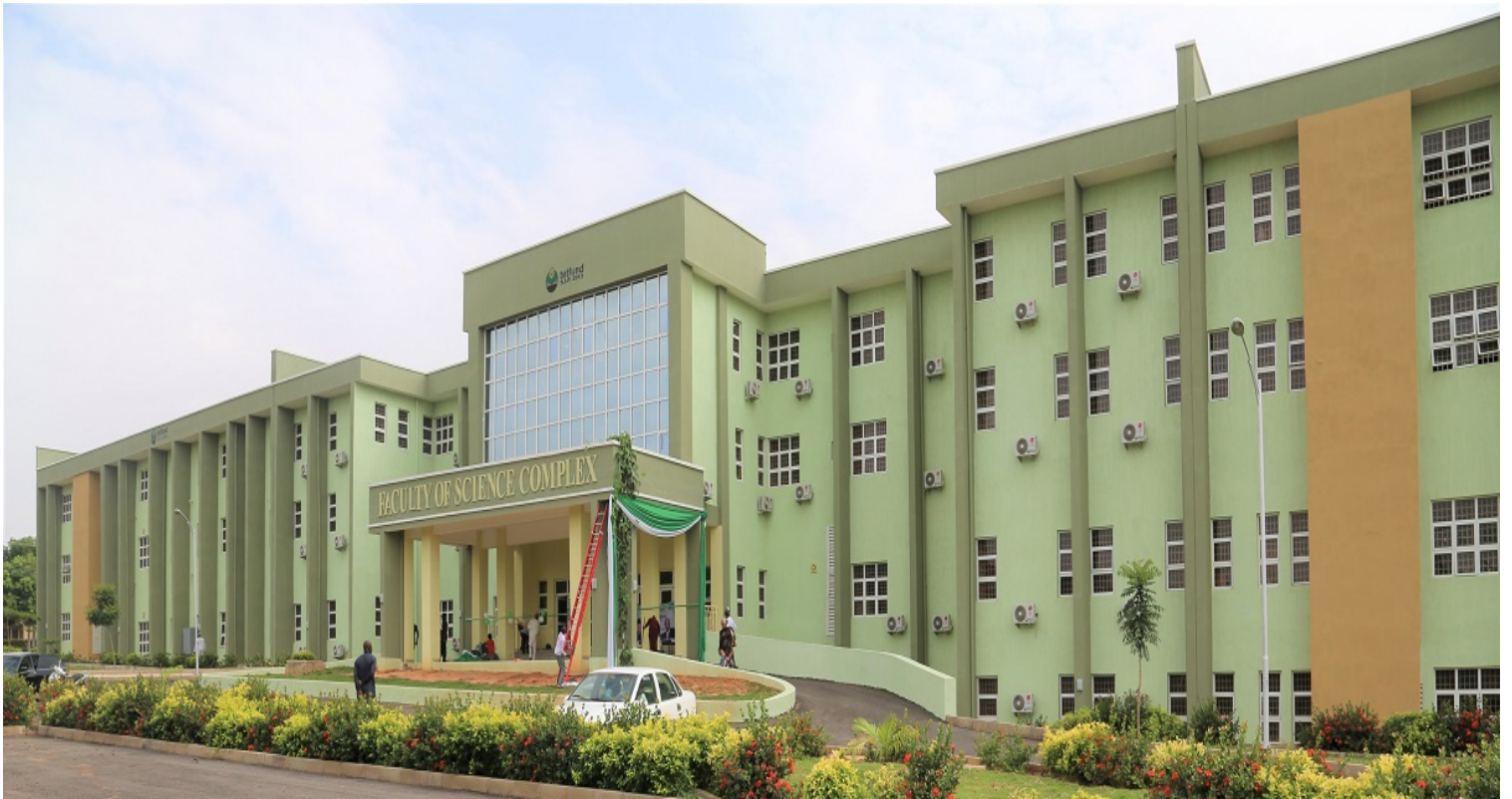
The Faculty of Science Building at Gombe State University