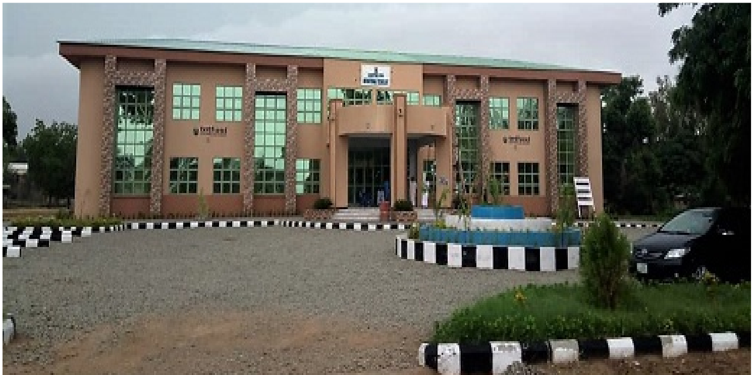
Centre for Industrial Textile, University of Maiduguri