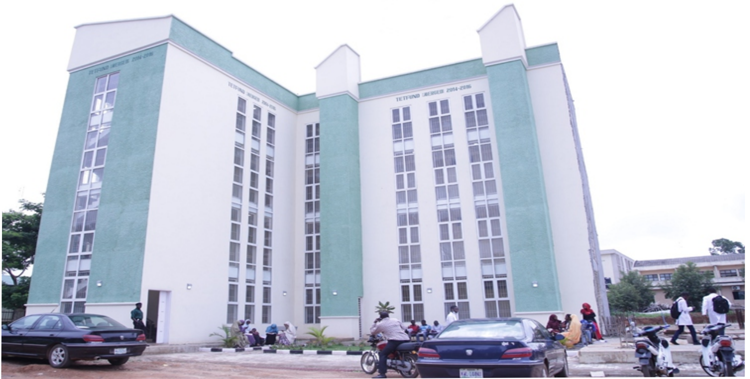
College of Medicine Building, Kaduna State University, Kaduna