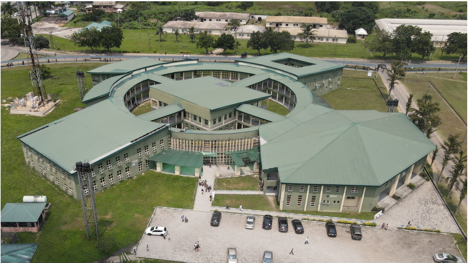
An aerial view of the 7-in-1 Building, University of Port Harcourt