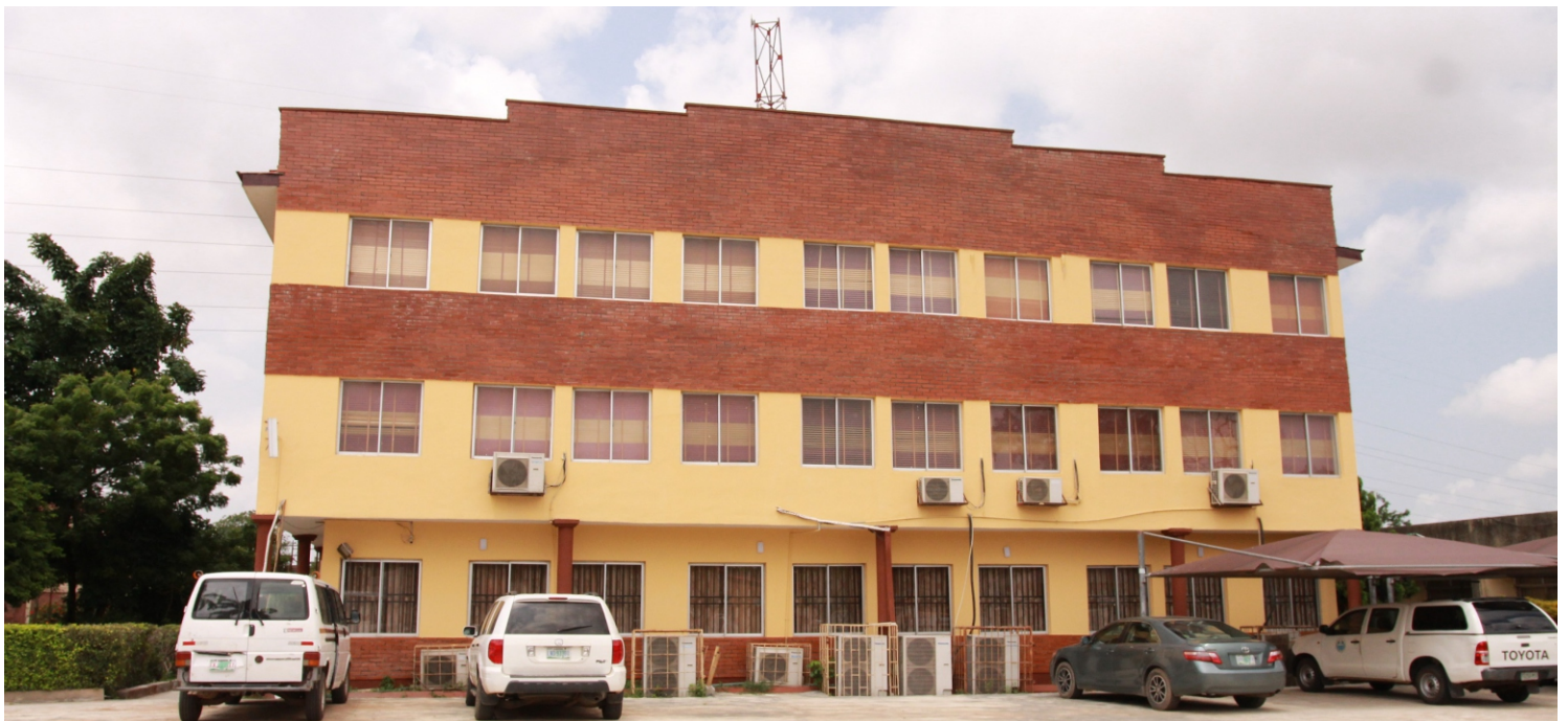
Centre for Information Technology and Systems, University of Lagos