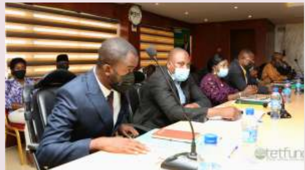
Cross section of the newly inaugurated members of the Committee on the TETFund National Research & Development Foundation (NRDF) Draft Executive Bill, during the Inauguration of the Committee on the TETFund National Research & Development Foundation (NRDF) Draft Executive Bill, at the TETFund Office, Abuja.