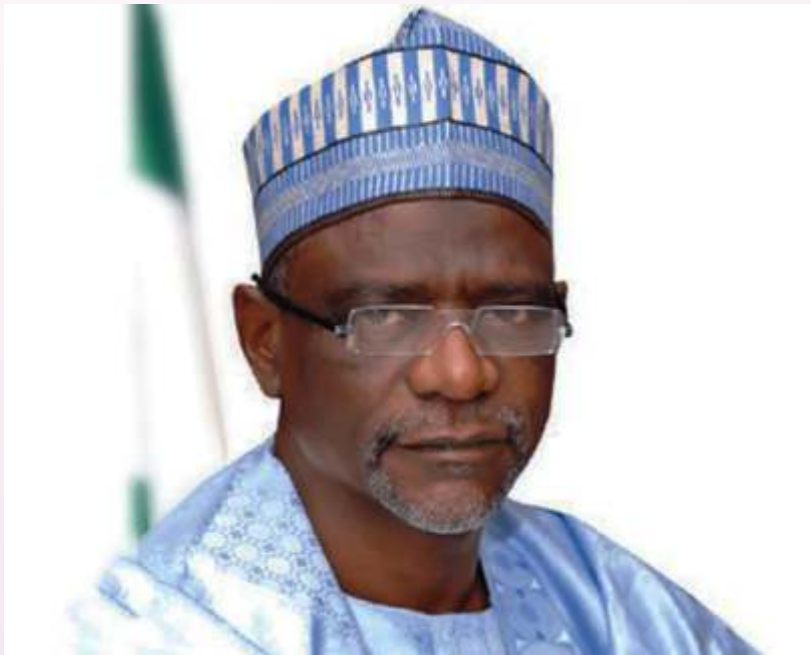
Mallam Adamu Adamu

The Minister of Education, Mallam Adamu Adamu has inaugurated the National Research and Development Foundation (NRDF) draft executive bill committee, with a call on members to propose legislation that will ensure a robust knowledge economy.