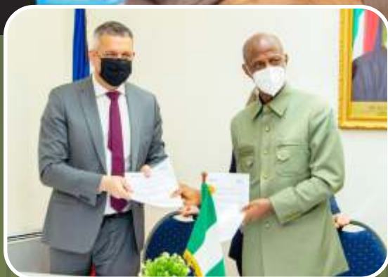
Nigeria, France Deepen Relationship in Science, Technology and Innovation in Tertiary Education