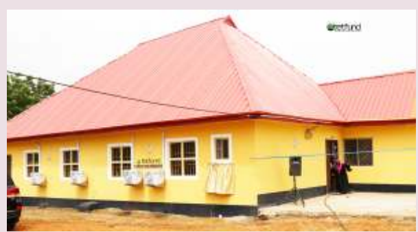
The newly commissioned University of Illorin Molecular Diagnostic and Research Laboratory