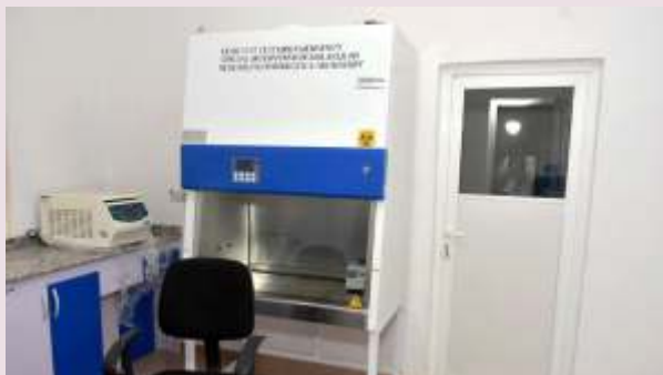
Some equipment in the newly commissioned University of Illorin Molecular Diagnostic and Research Laboratory.