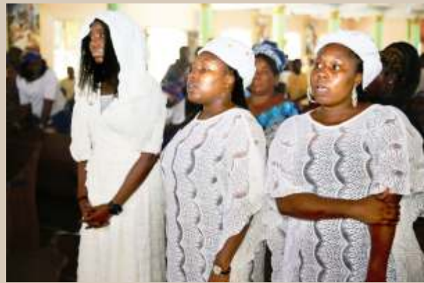
Daughters of the Deceased during the Funeral mass.