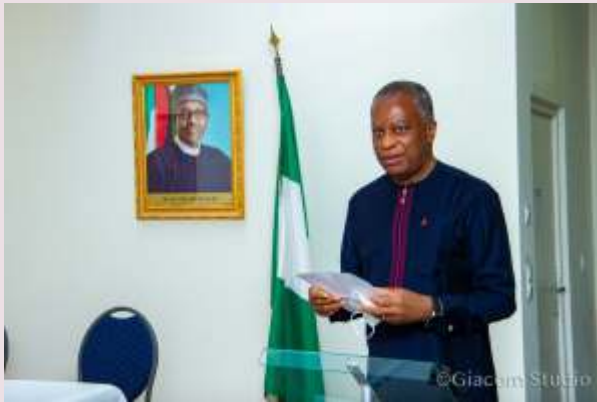
Minister of Foreign Affairs, Mr Geoffrey Onyeama representing the President Muhammadu Buhari (GCFR) gave a brief remark at the event