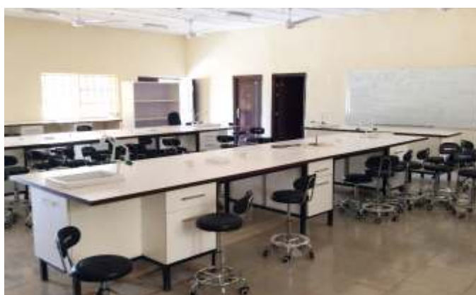
Medical Laboratory Science Complex For The Department of Biological Science, Federal Polytechnic Mubi, Adamawa State