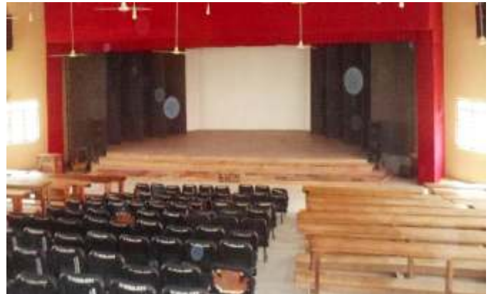
Equipment for College Of Theatre Arts Hall, College of Education, Katsina - Ala, Benue State