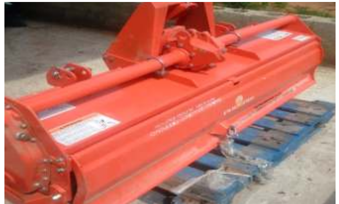
Equipment for Farm Power, Machinery, Irrigation and Drainage Laboratory, Kwara State University, Malete