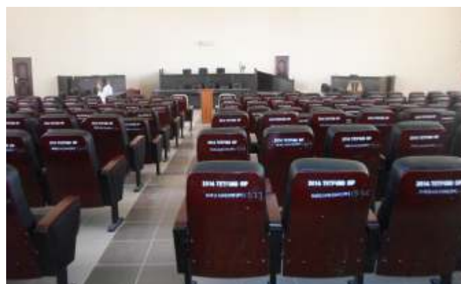
Furnishing of Moot Court And Library Block For Faculty of Law, Bayero University Kano, Kano State