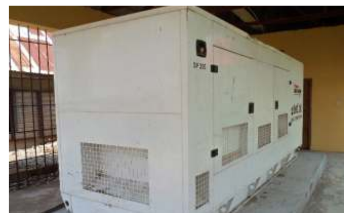
Installation Of 200kva Soundproof Generator With Accessories, College Of Education, Katsina - Ala, Benue State