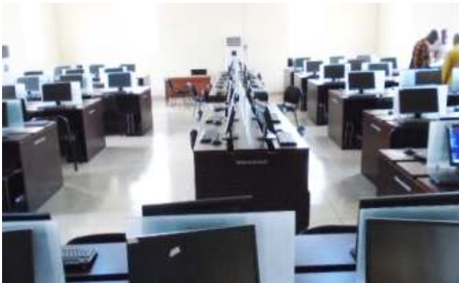
Desktops, Laptops, Printers and Various ICT Items, Delta State Polytechnic, Ogwashi-uku, Delta State