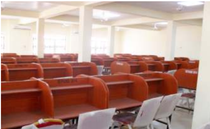
900 Capacity Library Complex, Shehu Shagari College of Education, Sokoto State