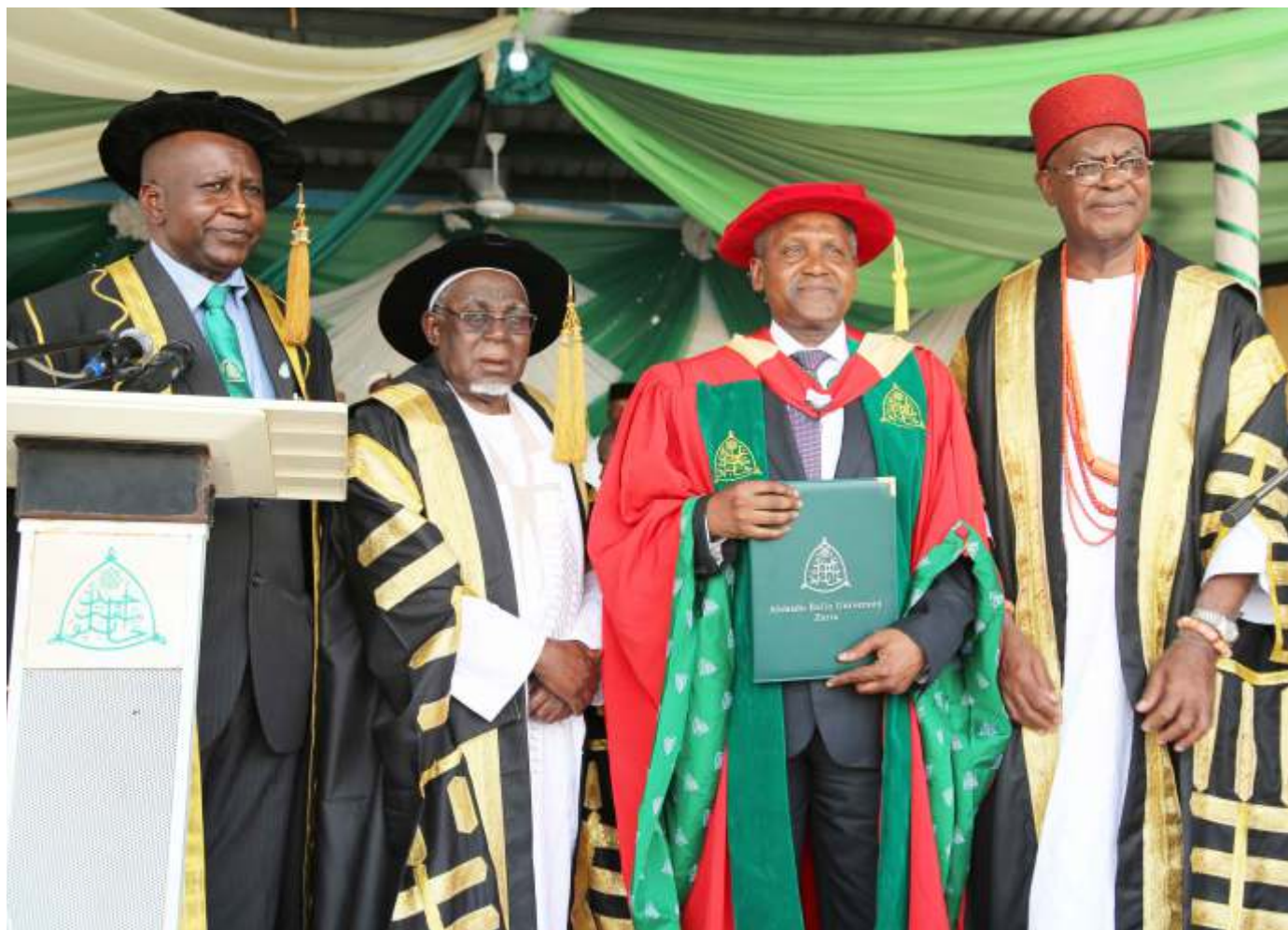
The President of Dangote Group, Alhaji Aliko Dangote (second right) with other dignitaries during the Convocation Ceremonies of Ahmadu Bello University Zaria