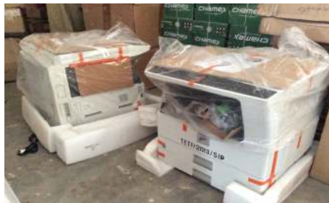
Department of Biological Science, Federal Polytechnic Mubi, Adamawa State