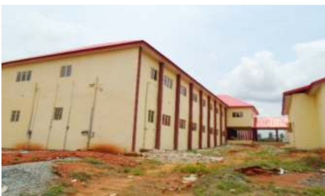
16 Offices, Twins Auditorium and 8 Classroom Storey, Delta State Polytechnic, Ogwashi-uku Delta State