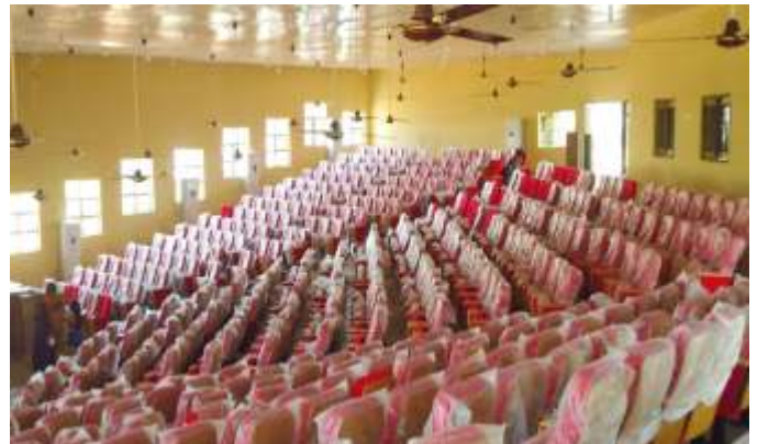
500 Capacity Lecture Theatre, Federal University of Technology, Owerri, Imo State