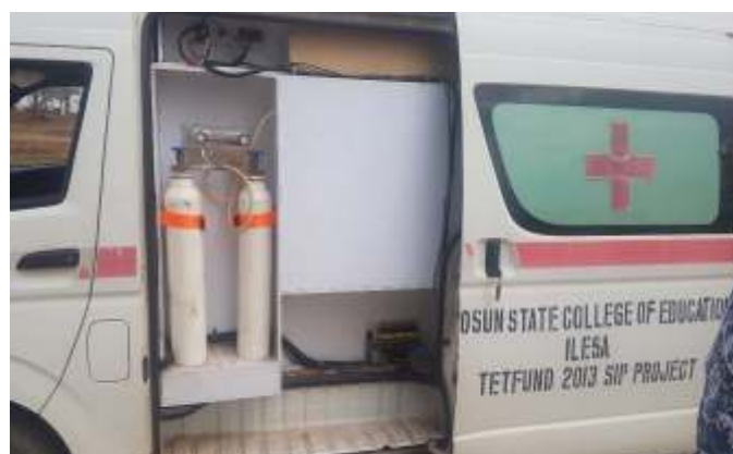
Fully Equipped Mobile Medical Facility, College of Education, Ilesha, Osun State