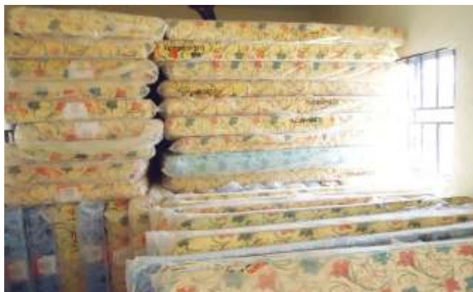
Mattress for Hostel, Taraba State University, Jalingo, Taraba State