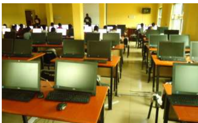
Furnishing of ICT Centre with various items, Alvan Ikoku College of Education, Owerri, Imo State