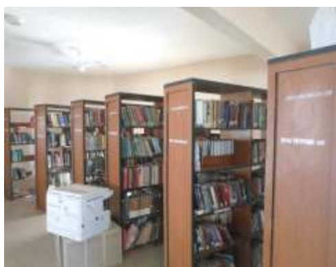
Furnishing of Moot Court And Library Block For Faculty of Law, Bayero University Kano, Kano State