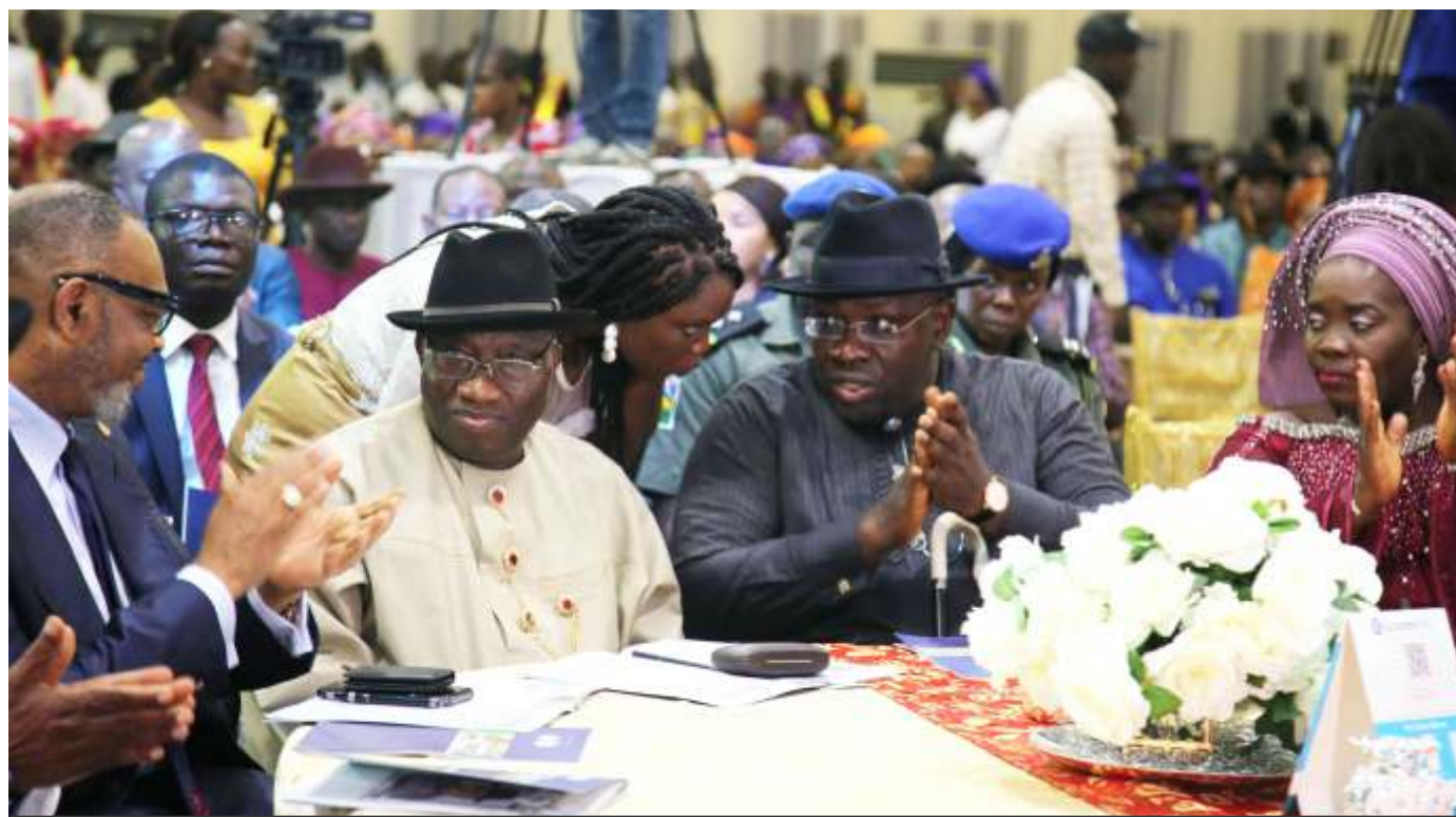
The Former President of Nigeria, Dr Goodluck Jonathan and the Governor of Bayelsa Honourable Henry Seriake Dickson during the event

The Former President of Nigeria, Dr Goodluck Ebele Jonathan, has saluted the efforts of the Bayelsa State Governor, the Honourable Henry Seriake Dickson, in educational development saying he has surpassed expectations.