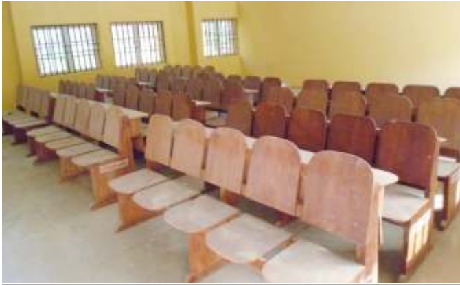
500 seater Classroom Furniture, College Of Education Ikwo, Ebonyi State