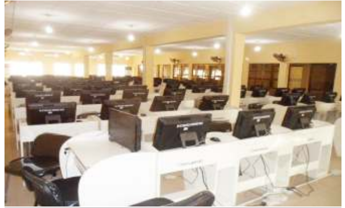
Cabling For Campus and ICT Centre, Ladoke Akintola University of Technology, Ogbomosho