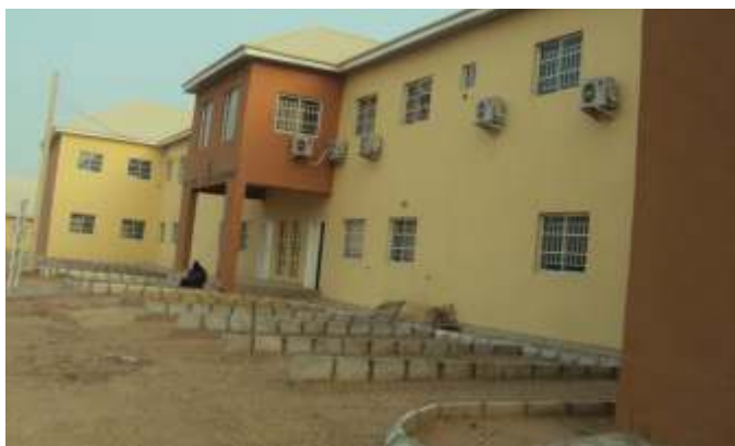
CONSTRUCTION OF SCHOOL OF ENGINEERING WITH ASSOCIATED EXTERNAL WORKS ABUBAKAR TATARI ALI POLYTECHNIC, BAUCHI, BAUCHI STATE.