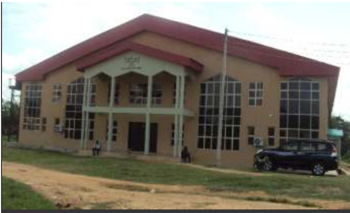
FURNISHING OF 650-CAPACITY LECTURE THEATRE INCLUDING SMART BOARD AND PUBLIC ADDRESS SYSTEM, , ADEKUNLE AJASIN UNIVERSITY, AKUNGBA-AKOKO, ONDO STATE