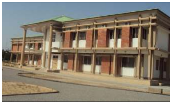
THE COMPLETED EXTERNAL WORKS FOR DEPARTMENT OF COMMUNITY MEDICINE & PHARMACOLOGY, UMARU MUSA YAR'ADUA UNIVERSITY, KATSINA, KATSINA STATE