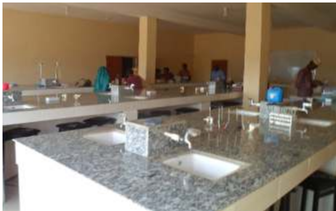
CENTRAL TEACHING LABORATORY, FEDERAL UNIVERSITY, BIRNIN KEBBI, KEBBI STATE