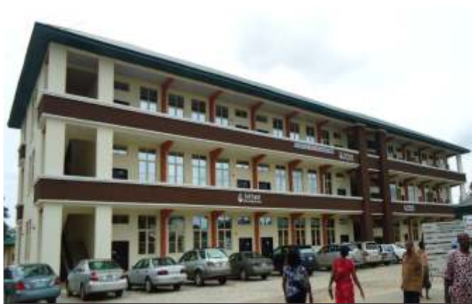
CONSTRUCTION OF 3-STOREY LECTURE HALLS AND OFFICES, ALVAN IKOKU COLLEGE OF EDUCATION, OWERRI, IMO STATE