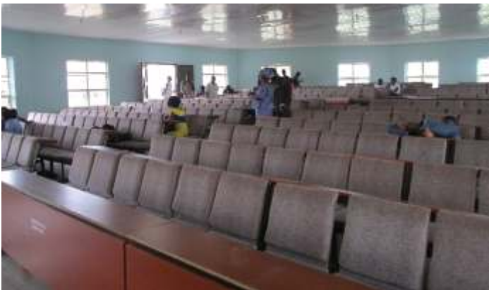
CONSTRUCTION AND FURNISHING OF PAPA AYO ORITSEJFOR LECTURE THEATRE WITH EXTERNAL WORKS FEDERAL POLYTECHNIC, ADO EKITI , EKITI STATE