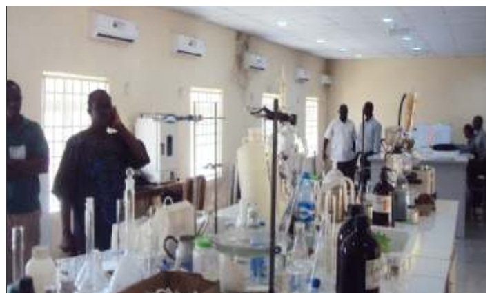
CENTRAL RESEARCH LAB. FOR FACULTY OF NATURAL AND APPLIED SCIENCE, SUPPLY OF LAB. EQUIPMENT AND FURNITURE , NASARAWA STATE UNIVERSITY, KEFFI