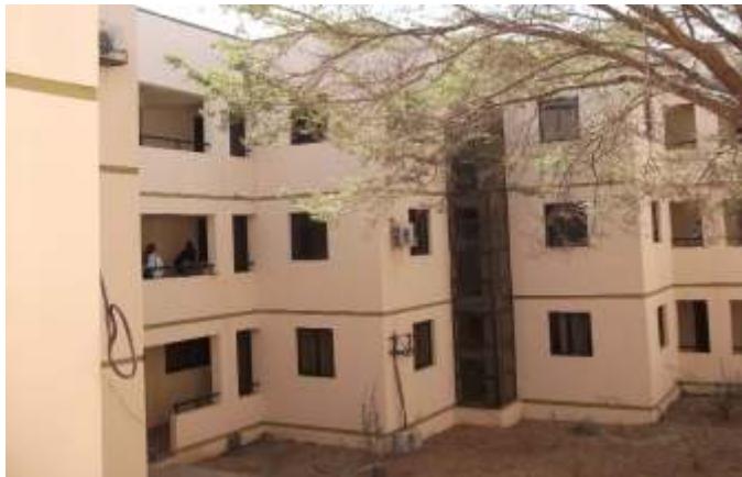
REHABILITATION OF SENATE BUILDING WITH EXTERNAL WORKS, ADAMAWA STATE UNIVERSITY MUBI ADAMAWA STATE