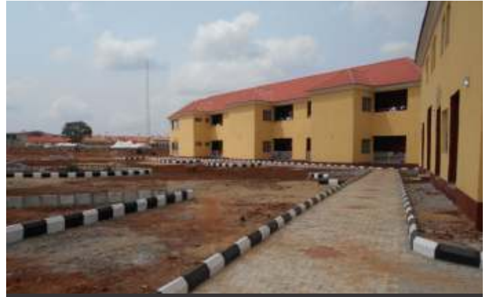
CONSTRUCTION AND FURNISHING OF ONE STOREY MALE HOSTEL, DELTA STATE POLYTECHNIC, OGWASHI-UKU DELTA STATE