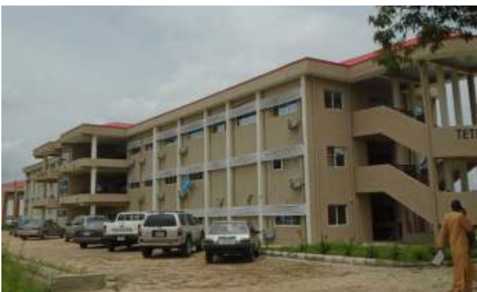
FACULTY OF SOCIAL SCIENCE, BENUE STATE UNIVERSITY MAKURDI, BENUE STATE