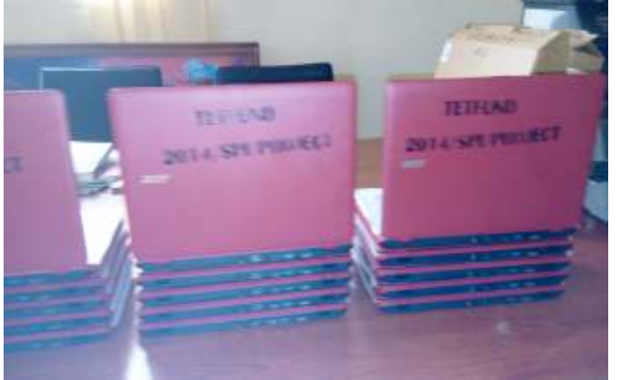
DESKTOPS, LAPTOPS, PRINTERS AND VERIOUS ICT ITEMS, OGWASHI-UKU, DELTA STATE POLYTECHNIC, DELTA STATE