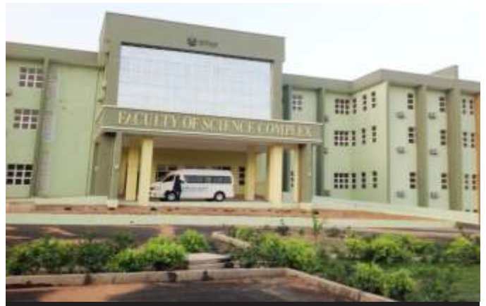
FACULTY OF SCIENCE COMPLEX WITH EXTERNAL WORKS, GOMBE STATE UNIVERSITY