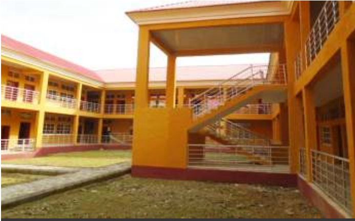
BLOCK OF CLASROOMS COLLEGE OF EDUCATION IKWO, EBONYI STATE