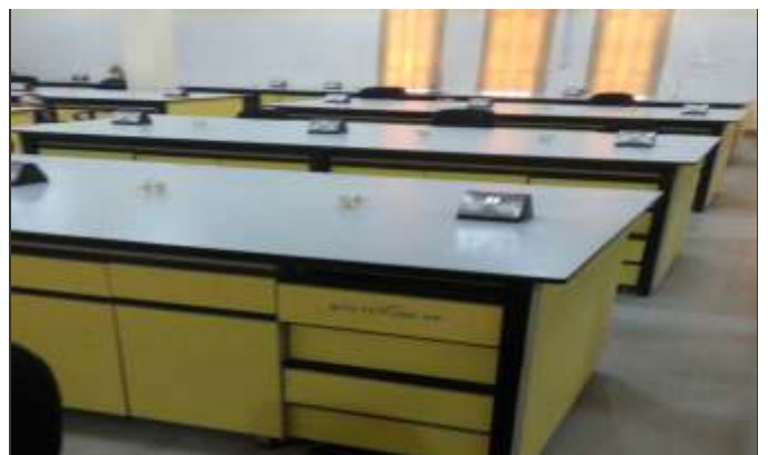
CENTRE FOR DRY LAND AGRICULTURE, BAYERO UNIVERSITY KANO, KANO STATE