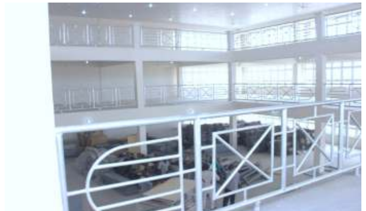
CONSTRUCTION OF LIBRARY COMPLEX, PLATEAU STATE POLYTECHNIC, BARKIN LADI, PLATEAU STATE