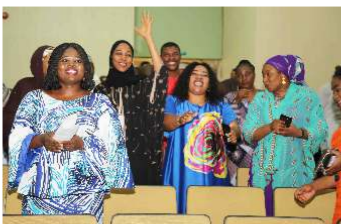
Some slated staff of TETFund rejoice over the announcement by the Executive Secretary of the approval of an improved Conditions of Service by the Head of Civil Service of the Federation.