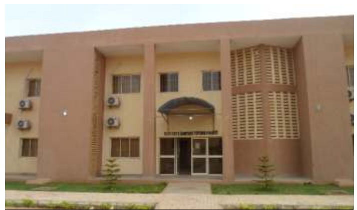
OFFICE BLOCK FOR THE SCHOOL OF MEDICAL LABORATORY SCIENCES, USMANU DANFODIYO UNIVERSITY, SOKOTO, SOKOTO STATE.