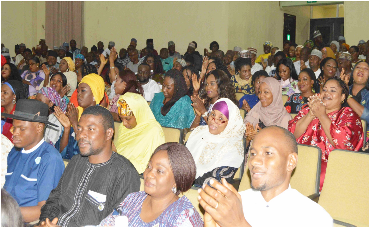
A cross section of the staff during the meeting with the Executive Secretary

All the Directors, Departmental Heads and Management staff were in attendance during the meeting.