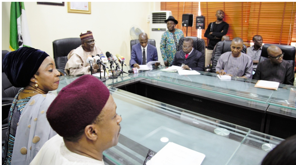
A cross section of the 8 th Edition of the Weekend Ministerial Press Briefing with Minister of Education, Mallam Adamu Adamu

He stated that on the whole, the Federal Government's investment in capacity building in public tertiary educational institutions under the Buhari administration from TETFund alone amounted to over N109 billion, having invested over N727 billion on infrastructural development within the same period.