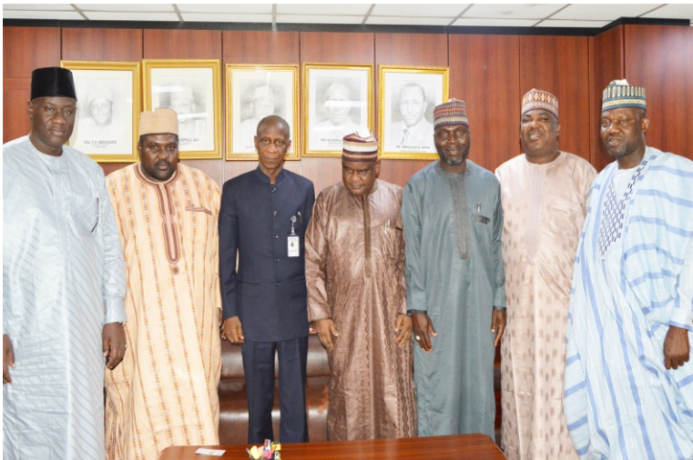
Professor Bogoro (3 rd L), Speaker, Bauchi State House of Assembly, Rt. Hon. Kawuwa Shehu Damina (4 th L) flanked by some Honourable members of Bauchi State House of Assembly during the courtesy visit