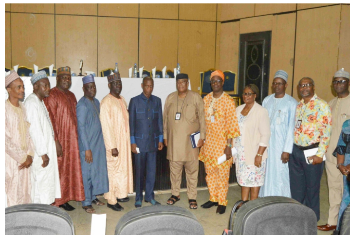
The Executive Secretary and Directors of TETFund at the maiden meeting with TETFund staff after his re-instatement